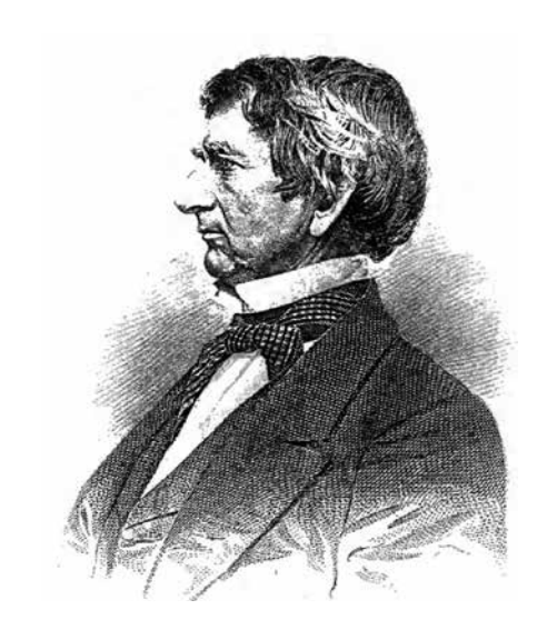
U.S. secretary of state William Seward directed the American ambassador in the Netherlands to negotiate a treaty for African colonization in Dutch Suriname. Image from The Works of William H. Seward , vol. 5 (Boston: Houghton, Mifflin, 1884), title page.

expected to increase, and other countries in the Caribbean had also engaged the United States in colonization agreements. In letter of October 8, 1862, Seward authorized Pike to continue with an agreement.<sup>35</sup> What prompted Seward to make this authorization at this time is unclear, but similar moves by the Lincoln administration indicate an executive influence. Once authorized by Seward, Pike established a few grounding principles for a possible future treaty. For example, all colonists were to remain free, migration was to be voluntary, and emigrants were to be properly looked after during transportation. The Dutch Department of Foreign Affairs passed the welcome news on to the Department of Colonies.