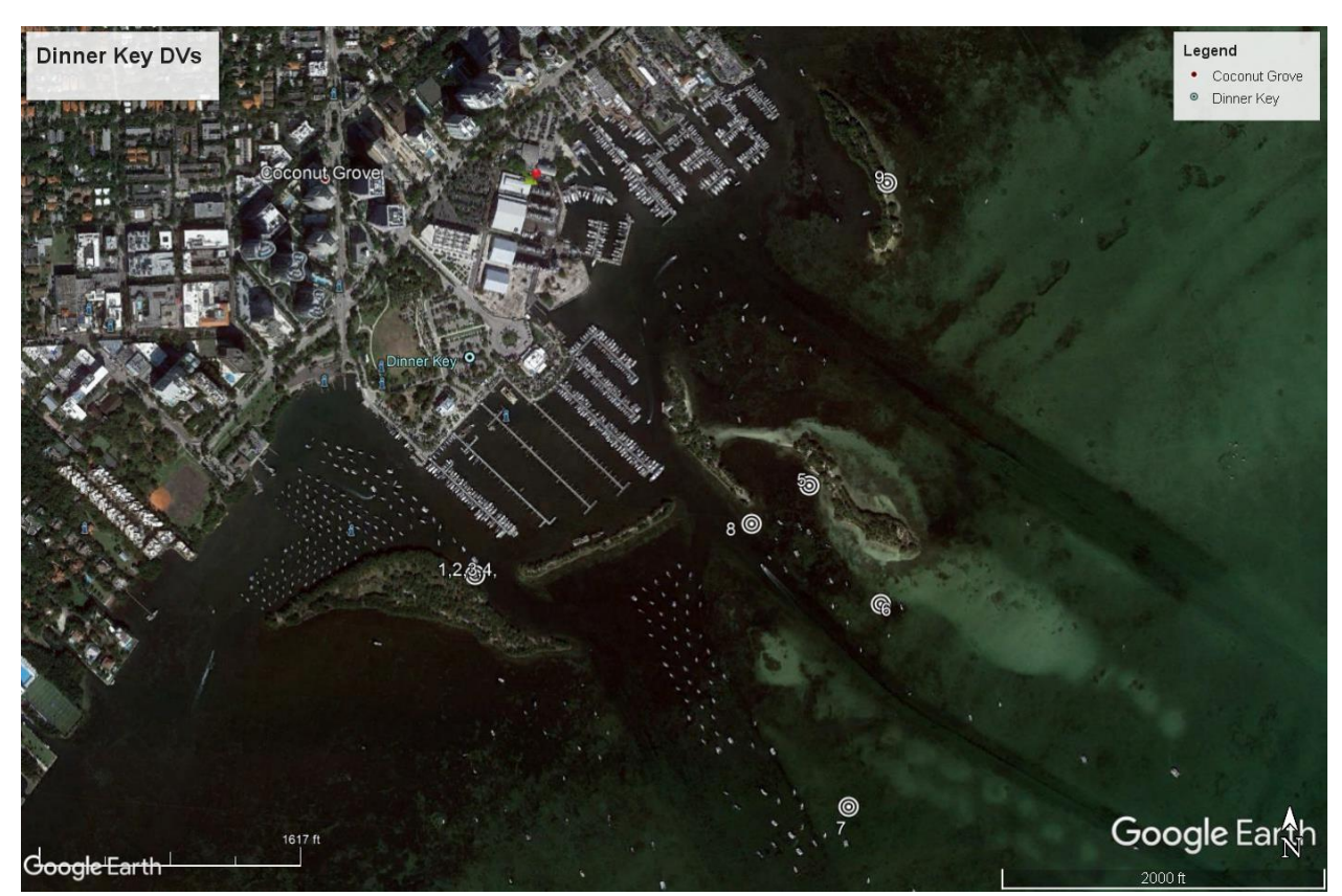
Figure 6. Derelict vessel locations within the city of Miami for which FIND grant funding has been awarded for removal.