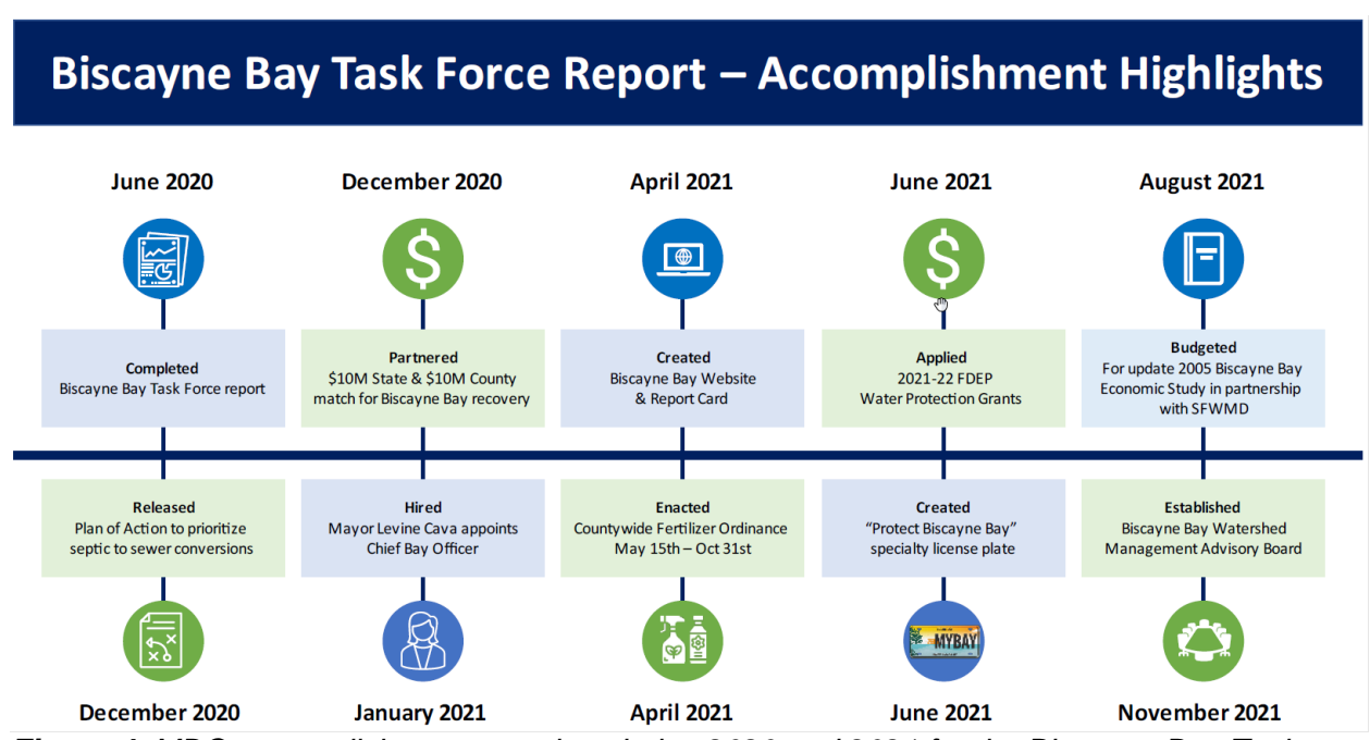
Figure 4. MDC accomplishment overview during 2020 and 2021 for the Biscayne Bay Task Force report.

The following information provides an update on Biscayne Bay issues and progress made to date.