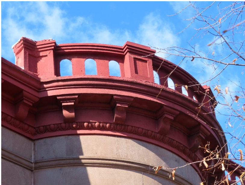
Figure 9: 360 East 25th Street, detail Michael Caratzas, LPC, November 2020