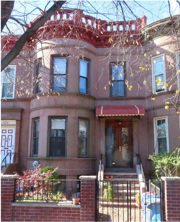
Figure 8: 360 East 25th Street Michael Caratzas, LPC, November 2020