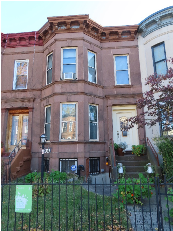
Figure 5: Brownstone house with angled bay 337 East 25th Street Michael Caratzas, LPC, November 2020