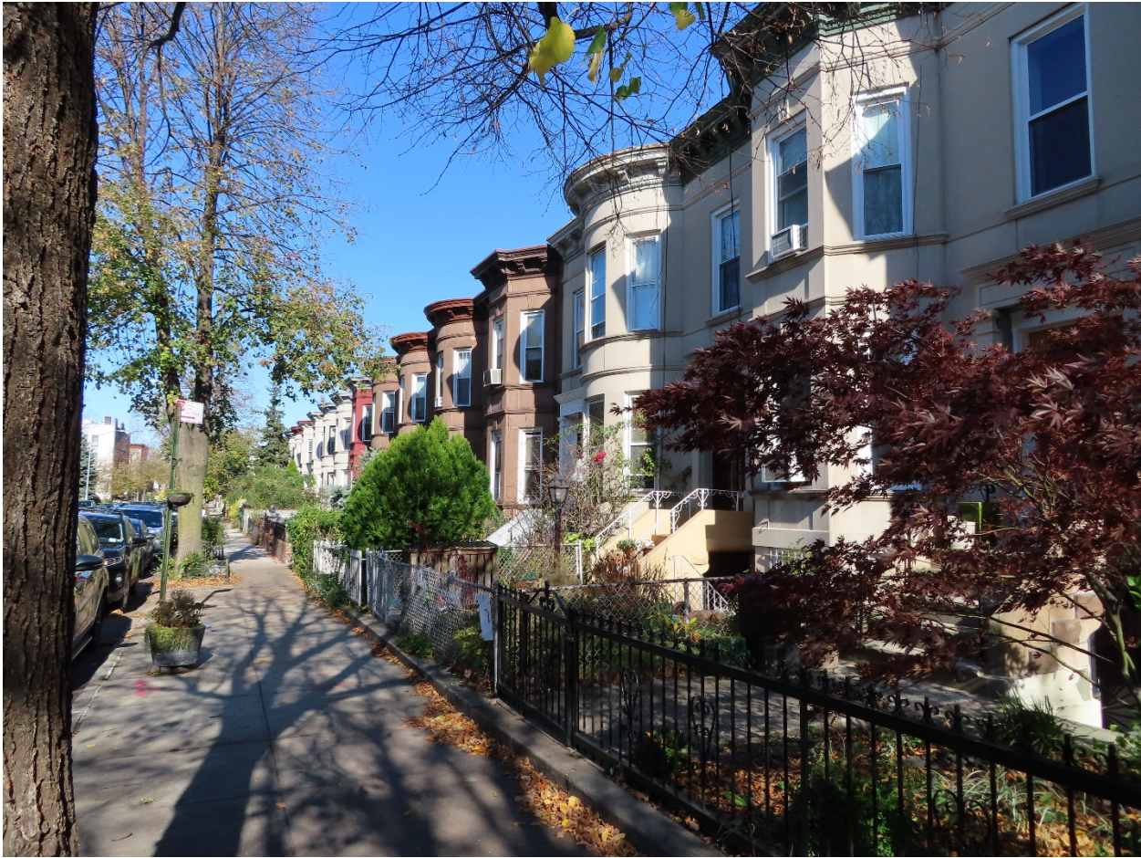
Figure 11: East side of East 25th Street, looking north from No. 371 Michael Caratzas, LPC, November 2020