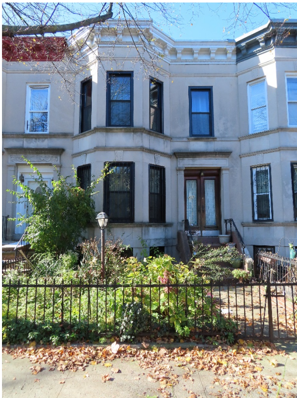
Figure 3: Limestone house with angled bay 372 East 25th Street Michael Caratzas, LPC, November 2020