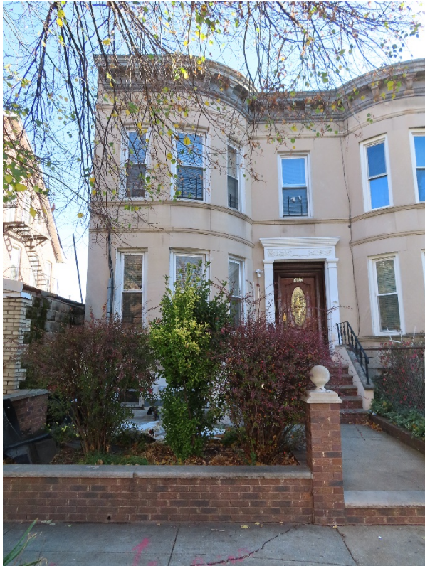
Figure 6: 315 East 25th Street Michael Caratzas, LPC, November 2020