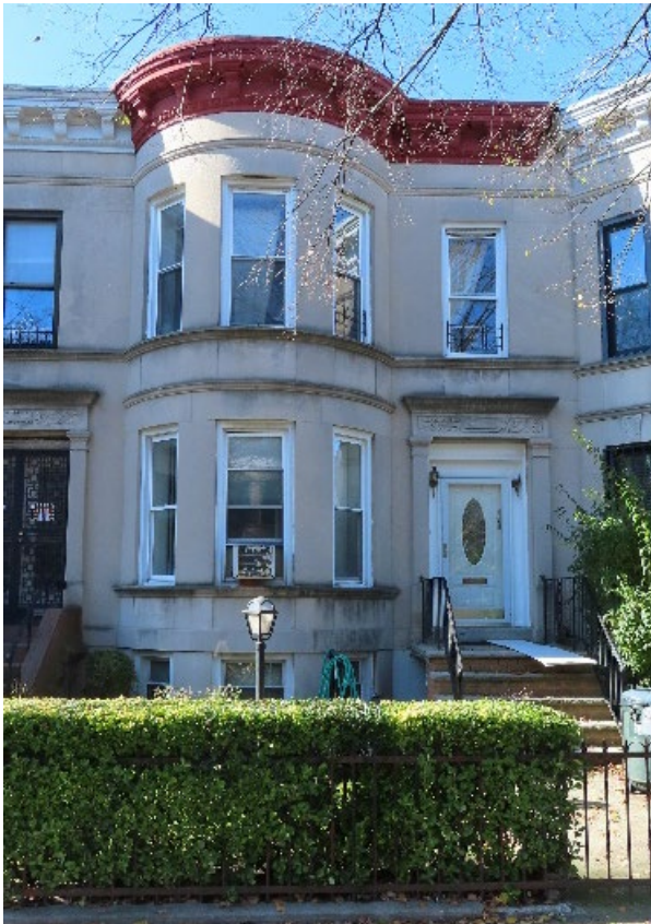
Figure 2: Limestone house with rounded bay 374 East 25th Street Michael Caratzas, LPC, November 2020