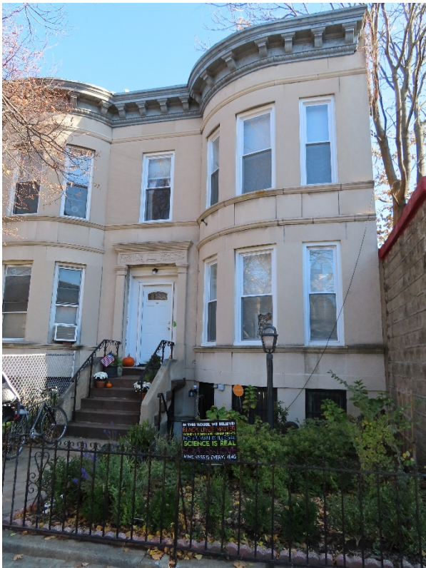
Figure 7: 377 East 25th Street Michael Caratzas, LPC, November 2020