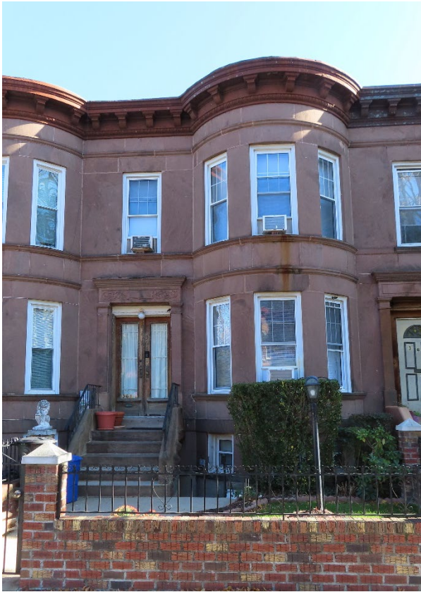
Figure 4: Brownstone house with rounded bay 361 East 25th Street Michael Caratzas, LPC, November 2020