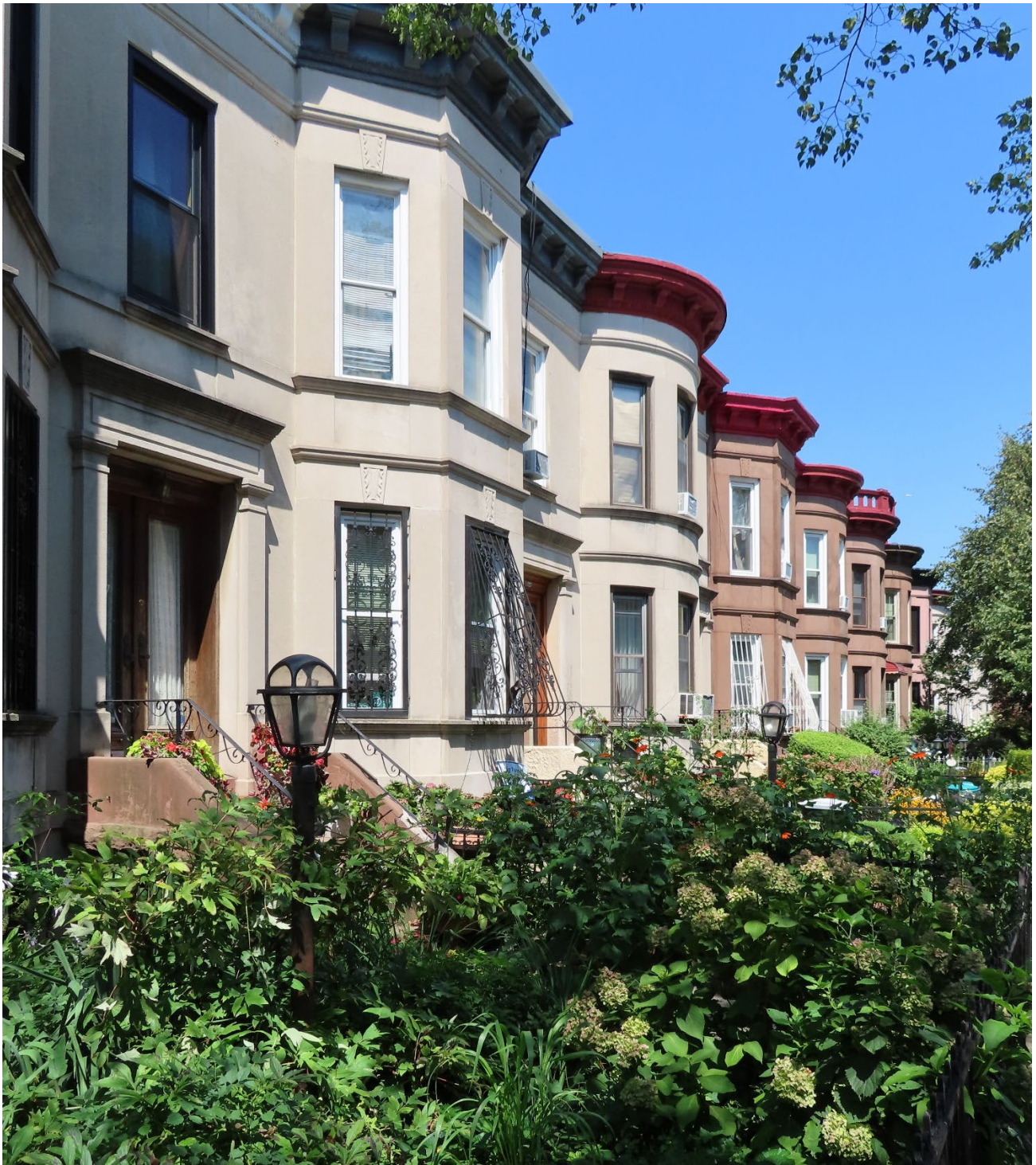
Figure 1: West side of East 25th Street, looking north from No. 368 Michael Caratzas, LPC, August 2020