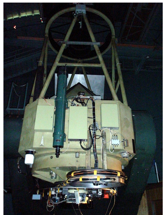
Figure 6 – Steward Observatory's 90-inch Bok telescope on Kitt Peak.

Catalina Sky Survey has also commissioned operations on the 2.3-m Bok survey telescope on Kitt Peak, in partnership with Spacewatch and the University of Minnesota. This collaboration (MPC code V00) has been awarded several nights per month for a deep survey near-sun in the evening and morning hours and for drilling deep into opposition during the darkest hours of the night. The larger aperture has already demonstrated its value in the discovery of a large and nearby Potentially Hazardous Asteroid during engineering for the new facility.