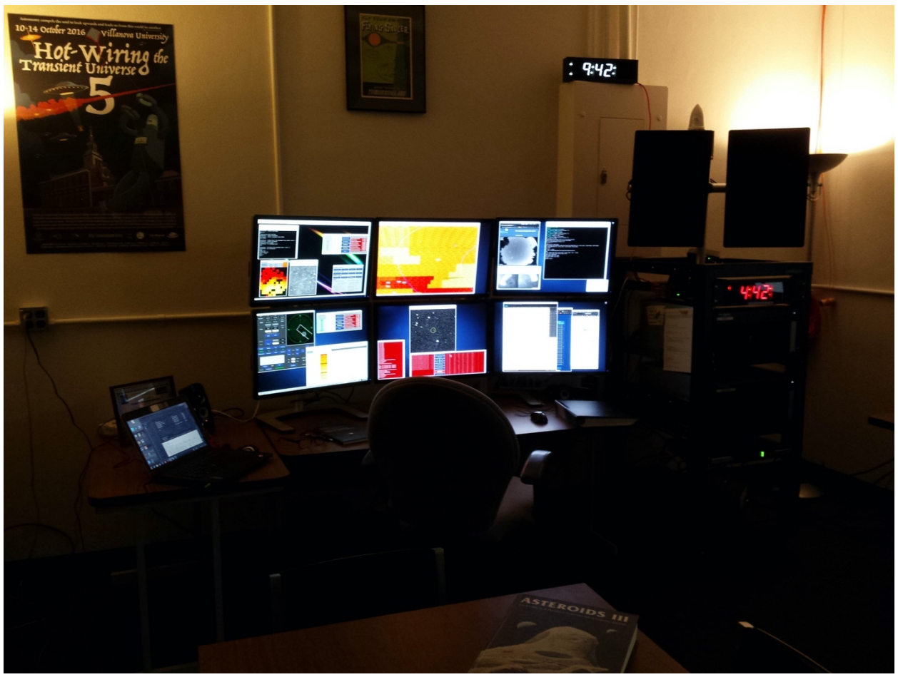
Figure 4 – CSS remote observing console at the Lunar and Planetary Laboratory on the campus of the University of Arizona in Tucson. This is a frequent station for the observer for Catalina's 1-m follow-up telescope, I52. G. Leonard

Catalina Sky Survey realized a significant addition to its NEO discovery capabilities with the commissioning of the 1.0-m astrometric follow-up telescope on Mount Lemmon, MPC code I52. By offloading same-night and subsequent follow-up responsibilities from the survey telescopes, these are freed to generate even more candidate NEOs for follow-up. The combination of I52 and later V06 (below) have become the most productive follow-up telescopes for NEOCP follow-up and arc extensions. A major prime focus upgrade to I52 is nearing completion. I52 was also the first CSS telescope to be operated fully remotely from the University of Arizona campus as well as from the control room of our other telescopes and has served as the pilot for such capabilities to remotely operate our other telescopes, including from our observers' homes during the COVID pandemic.