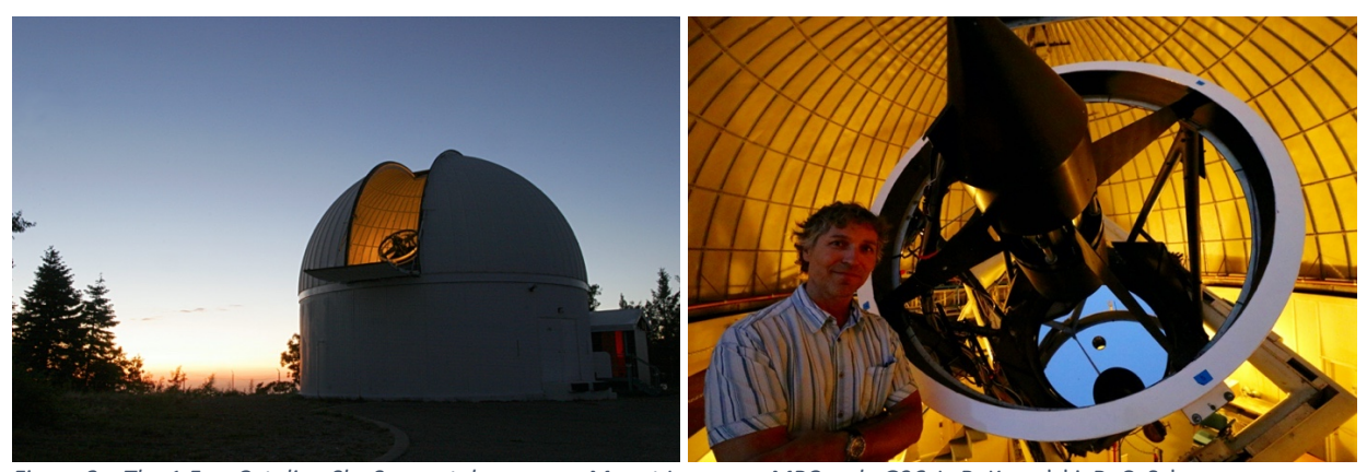
Figure 2 – The 1.5-m Catalina Sky Survey telescope on Mount Lemmon, MPC code G96.

The Catalina Sky Survey 60-inch survey telescope on Mount Lemmon, MPC code G96, has been a significant contributor to the annual Near-Earth Object discovery statistics since 2005. Indeed, as of 2020, G96 is the most prolific single telescope in the grand total of NEOs discovered (7,814) and NEO observations (178,966), as well as of incidental observations of asteroids of all kinds (45,715,932).