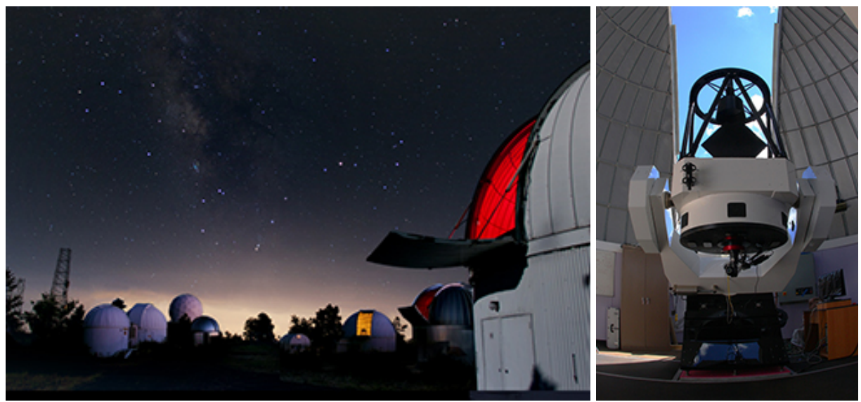
Figure 7 – Mount Lemmon SkyCenter and the 0.8-m Schulman telescope.

CSS is always looking for access to new, or new-to-us, telescopes. In the near future this will include the 0.8-m Schulman telescope of the Mount Lemmon SkyCenter<sup>4</sup>, which is MPC code G84 when used for astrometric follow-up. We have been funded by NASA to provide a new camera and will receive a significant amount of telescope time in return. The Schulman will be used for astrometric follow-up to offload brighter objects from Catalina Sky Survey's nearby 1.0-m I52.