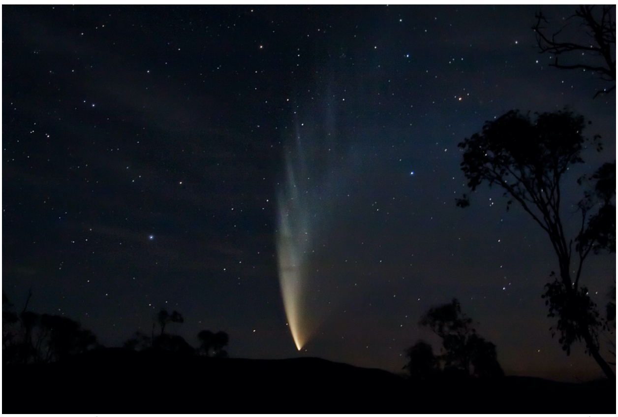
Figure 3 – Comet C/2006 P1 McNaught; photo taken from Swifts Creek, Victoria, Australia at 3pprox.. 10:10PM. Taken at f/4, ISO 800, 20 seconds and ~24 mm with post-processing in Photoshop to bring out details.

From 2003 to 2013 Catalina Sky Survey operated the only major NEO survey telescope in the southern hemisphere in partnership with the Australian National University using the 0.5-m Uppsala Schmidt telescope at Siding Spring Observatory in New South Wales, Australia. The Siding Spring Survey operated under MPC code E12 and is credited with discovering 467 Near-Earth Asteroids as well as many comets, including Comet McNaught, the "Great Comet of 2007" (see figure 1).