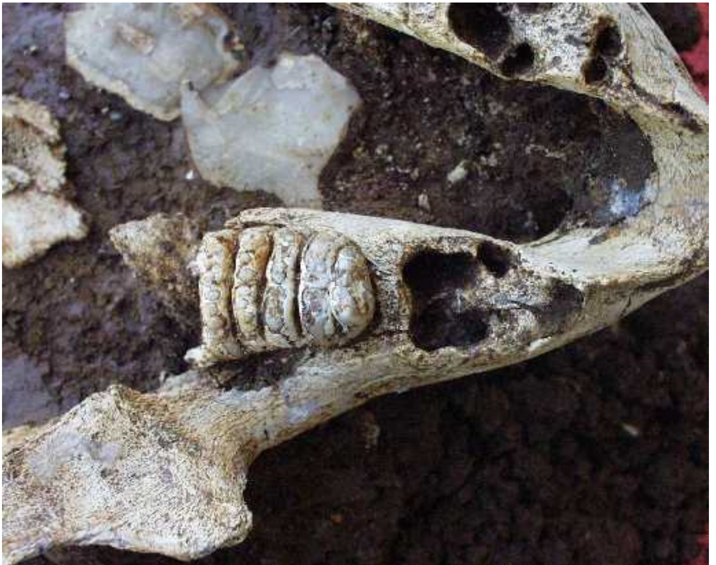
Supplementary Figure A10. Juvenile Stegodon jaw with associated stone artefacts, Sector XI, Liang Bua.