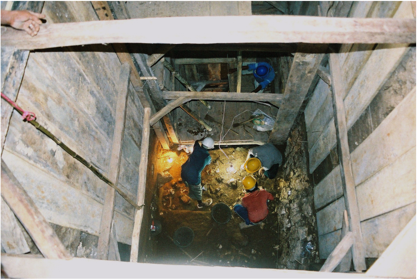
Supplementary Figure A8. General view of Sectors VII (bottom) and XI (top) during the 2004 excavation.