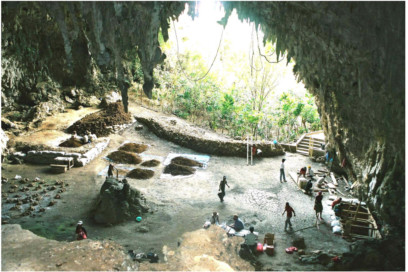
Supplementary Figure A7. General view of Liang Bua from the rear looking north. The open Sector VII/XI trench is located along the east wall of the cave on the lower right hand side. (Photo: M. J. Morwood).