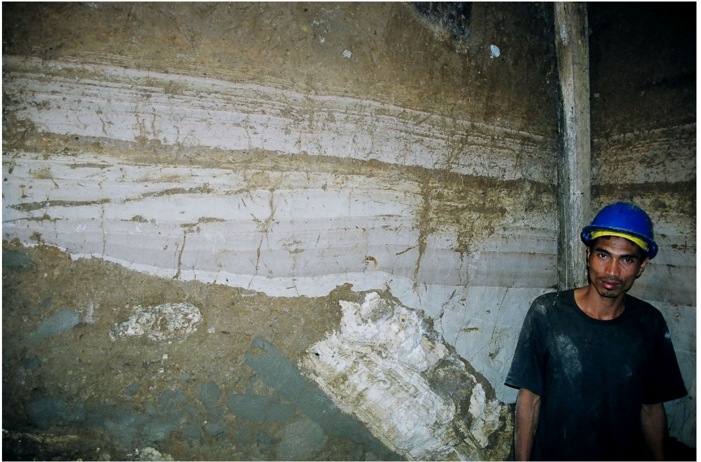
Figure A12. 'White' tuffaceous silts in the northwest corner of Sector VII. These were deposited about 12-11 kyr BP. The remains of Homo floresiensis and Stegodon occur to the base of these silts, but are absent from overlying layers, which are characterised by the remains of extant fauna and modern humans.