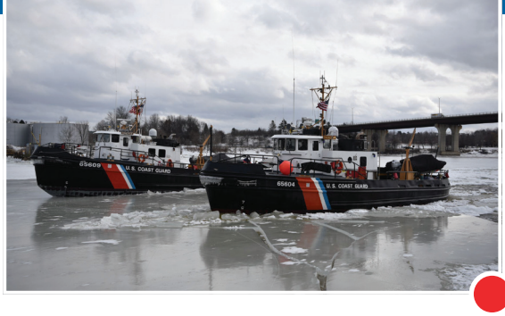
65-foot Small Harbor Tug