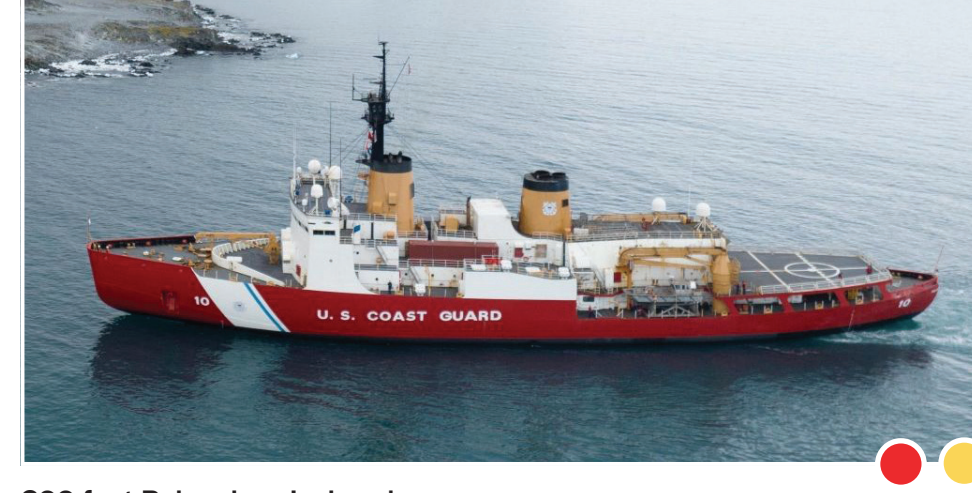
460-foot Polar Security Cutter

Artist rendering courtesy of Bollinger Mississippi