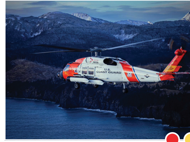
MH-60T Medium Range Recovery Jayhawk