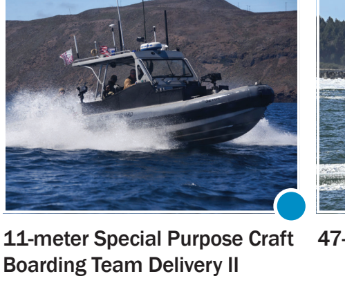
11-meter Special Purpose Craft Boarding Team Delivery II