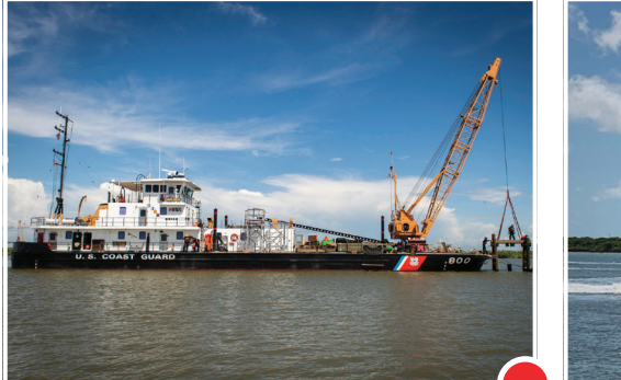
160-foot Inland Construction Tender