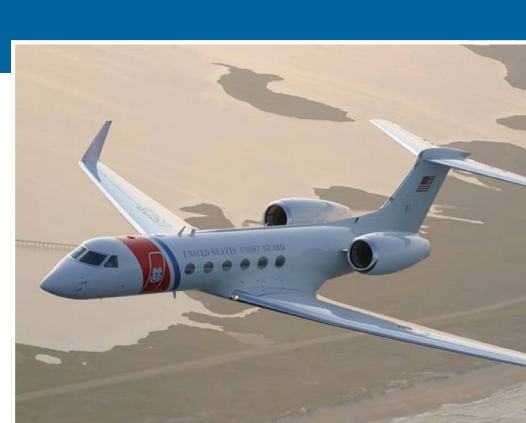
Long Range Command and Control Aircraft