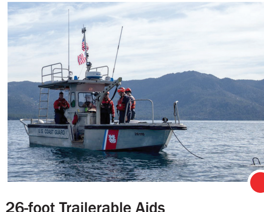
26-foot Trailerable Aids to Navigation Boat