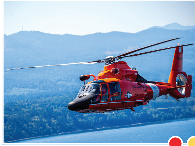
MH-65 Short Range Recovery Dolphin