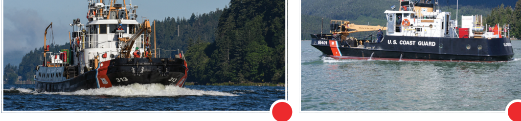
100-foot Inland Buoy Tender

The Coast Guard will recapitalize the capabilities of the service's current fleet of inland tenders and barges with three class of Waterways Commerce Cutters.