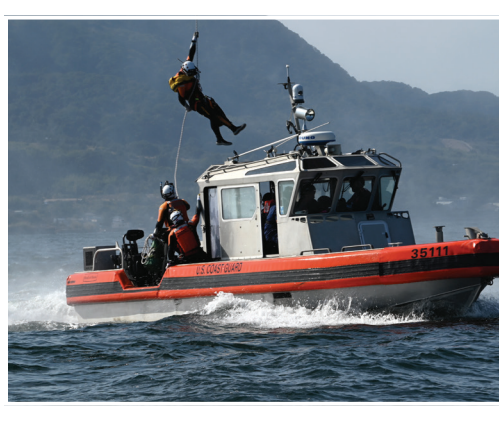
Long Range Interceptor Cutter Boat