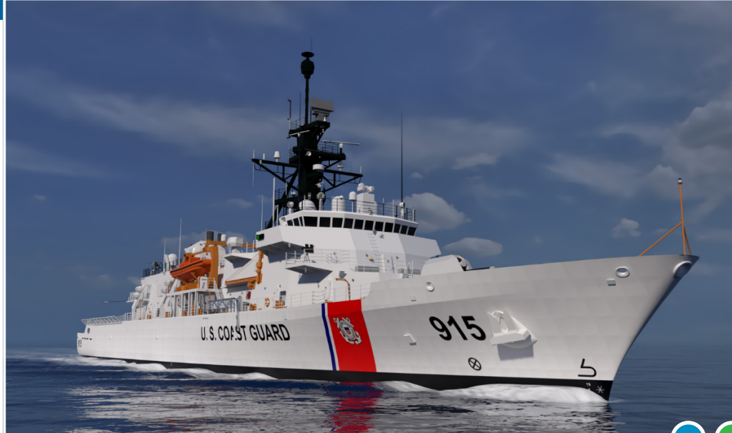
360-foot Heritage-class Cutter