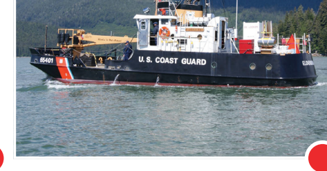
65-foot Inland Buoy Tender