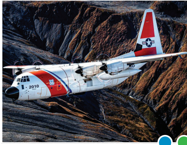
HC-130J Super Hercules