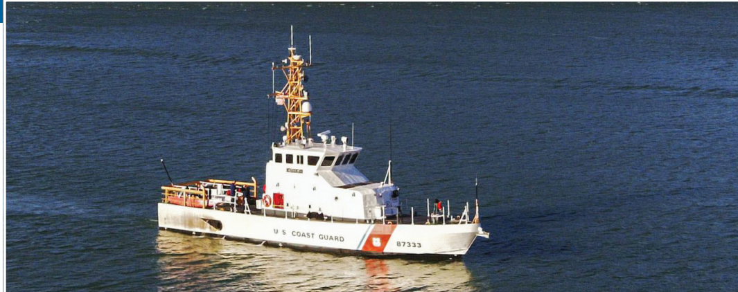
87-foot Marine Protector-class Patrol Boat