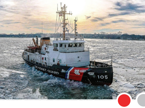
140-foot Bay-class Icebreaking Tug