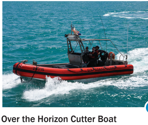
Over the Horizon Cutter Boat