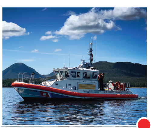
45-foot Response Boat-Medium

The Coast Guard has approximately 1,700 boats with differing capabilities based on mission; below is a representative sample.