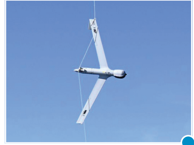
Contractor-owned, contractor-operated UAS capability for the National Security Cutter