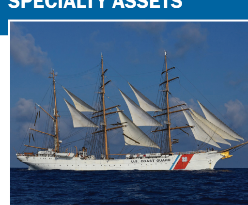
295-foot Training Barque