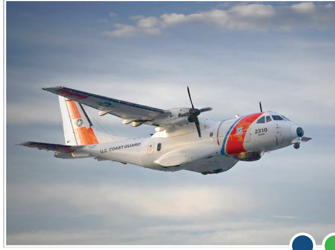
HC-144 Ocean Sentry