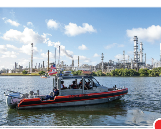
29-foot Response Boat-Small II