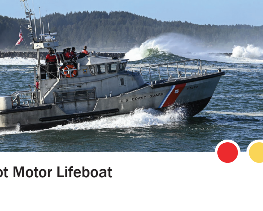
47-foot Motor Lifeboat