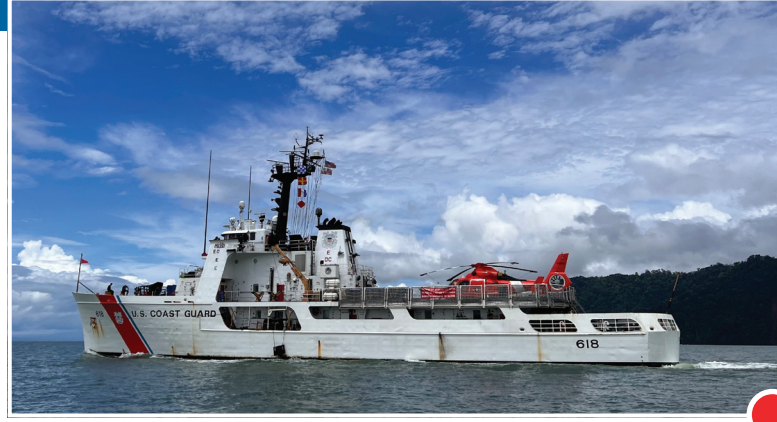
210-foot Reliance-class Medium Endurance Cutter