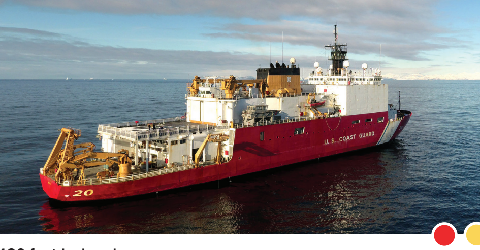
240-foot Great Lakes Icebreaker