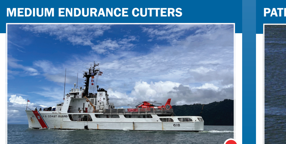
399-foot Polar-class Icebreaker