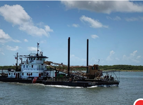
75-foot Inland Construction Tender