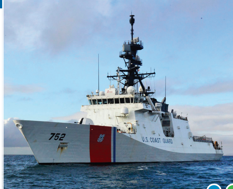
418-foot Legend-class Maritime Security Cutter