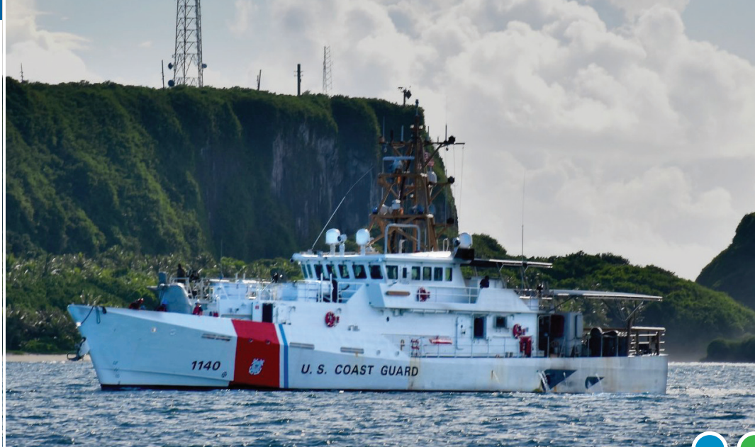
154-foot Sentinel-class Cutter