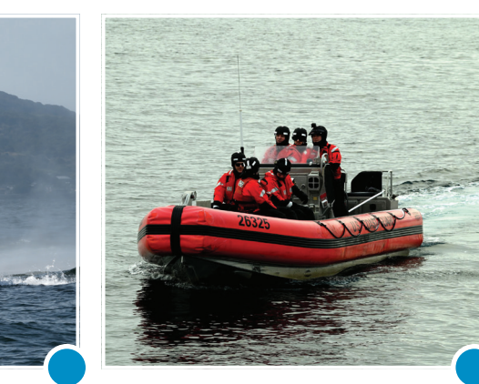
22-foot Cutter Boat-Large