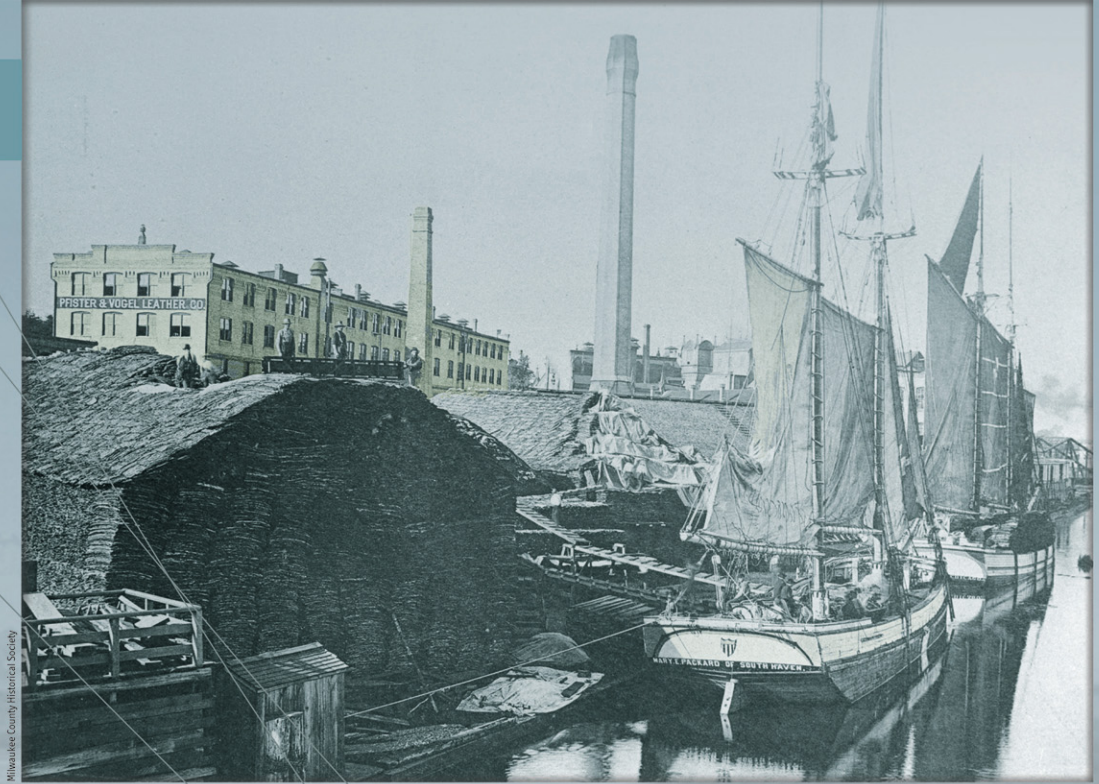
Milwaukee County Historical Society

Many European immigrants got their first glimpse of Wisconsin on schooners and steamships. By the turn of the 20th century, steamships replaced schooners on the liquid highways.