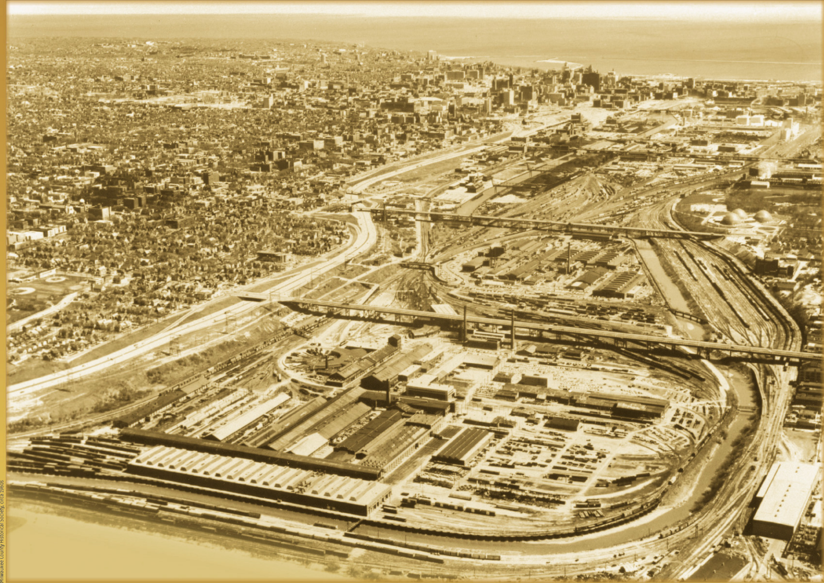
circa 1900s

As trucks and airplanes became the primary transport for people and freight, rail use declined. The Shops closed in 1985, and today only two smokestacks remain.