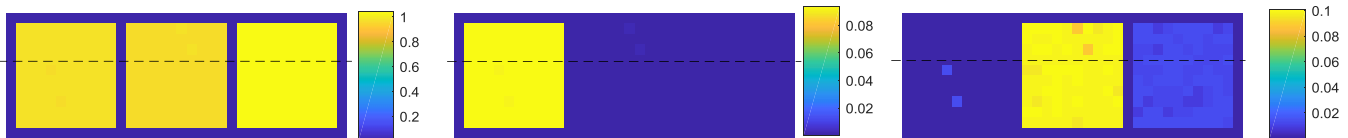
Figure 2: Decomposition results of the proposed method: ABS basis image (left), Br basis image (middle) and Cl basis image (right)

In view of the material composition of the object, we choose ABS, bromine (Br) and chloride (Cl) as a basis of materials. The reason for having not selected phosphorus as the basis is that P and Cl have too close atomic numbers and experiments showed that they can be barely separated. Patch size for regularization is set to be 2×2. Figure 2 demonstrates the decomposition results of the scanned phantom. All three cubes are visible in Figure 2 (left), due to the containment of ABS. The ABS+TBBPA cube is well separated and highlighted in the Br basis image (middle). The other two tubes all appear in the Cl basis image (right), but there exists significant density difference between them, therefore they can be easily distinguished by the observer even if the concentration of FRs changes more or less. Figure 3 gives the 1-D profile along dash lines in Figure 2, the comparison between theoretical densities (see Table 1) of 3 basis materials and our measurements is illustrated. Their high consistence indicates that the proposed method can not only separate 3 ABS-FR materials but also obtain high quantification accuracy of the basis materials.