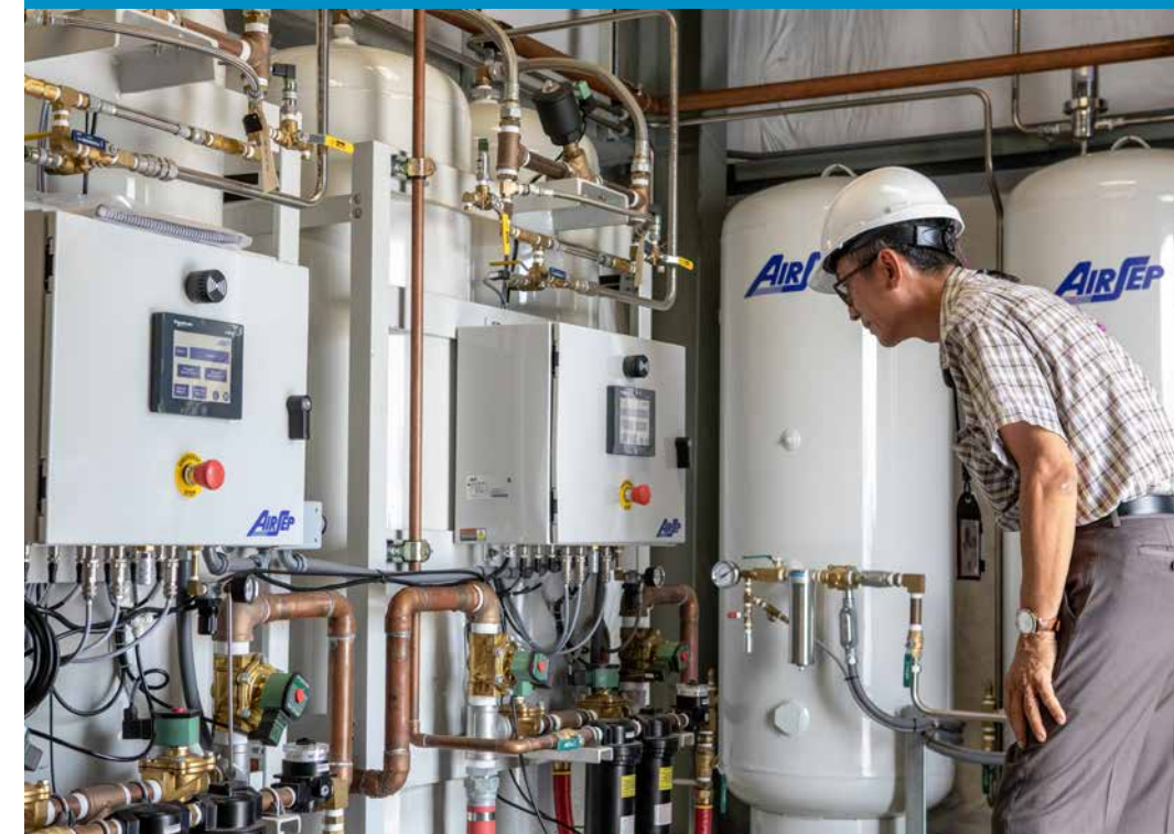
A photograph taken July 24, 2019, shows new air tanks, piping and control panels were installed in the Utility Annex near the Vehicle Assembly (VAB) Building at NASA's Kennedy Space Center. The Utility Annex, which provides 8,000 gallons of chilled water per minute to the VAB and other facilities in the Launch Complex 39 area, is being upgraded and repaired. The facility also contains boilers necessary to provide hot water to the VAB. The center's Engineering Directorate is making the repairs and upgrades to the facility to prepare for the agency's Artemis missions to the Moon and on to Mars.