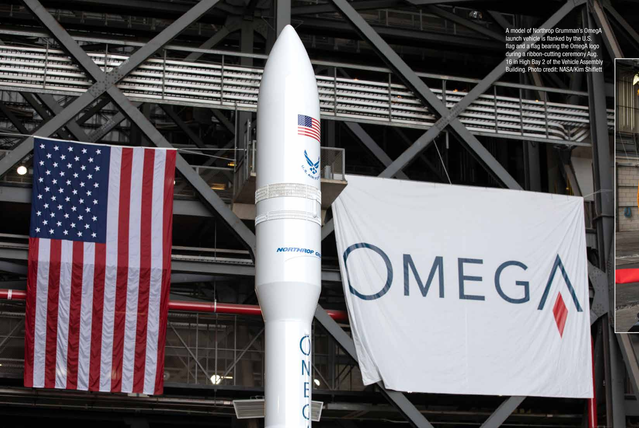
A model of Northrop Grumman's Omega launch vehicle is flanked by the U.S. flag and a flag bearing the Omega logo during a ribbon-cutting ceremony Aug. 16 in High Bay 2 of the Vehicle Assembly Building.