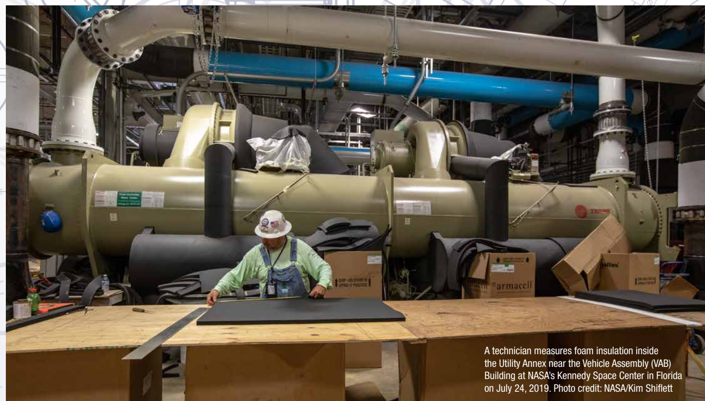
A technician measures foam insulation inside the Utility Annex near the Vehicle Assembly (VAB) Building at NASA's Kennedy Space Center in Florida on July 24, 2019.

"When the repairs and upgrades are completed, the facility will provide an up-to-date, more efficient redundant capacity for all chilled water requirements to 17 facilities," Otero said. "This includes critical processing facilities supporting commercial as well as government space operations efforts in the Launch Complex 39 area."