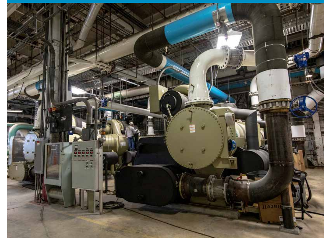
A view of the inside of the Utility Annex near the Vehicle Assembly Building at NASA's Kennedy Space Center on July 24, 2019.