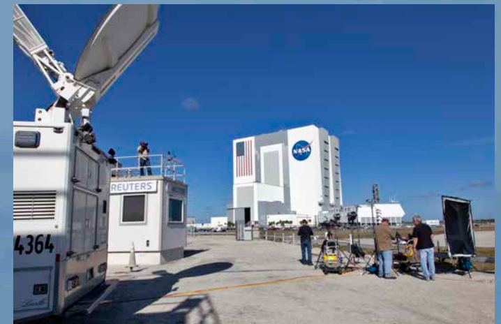
Employees, invited guests and members of the news media gathered to witness the liftoff of the SpaceX Falcon Heavy rocket from Launch Complex 39A. The demonstration flight is a significant milestone for the world's premier multi-user spaceport. In 2014, NASA signed a property agreement with SpaceX for the use and operation of the center's pad 39A, where the company has launched Falcon 9 rockets and is preparing for the first Falcon Heavy. NASA also has Space Act Agreements in place with partners, such as SpaceX, to provide services needed to process and launch rockets and spacecraft.