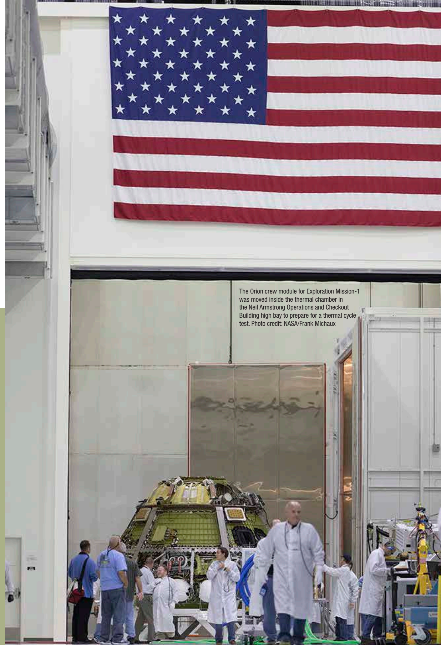
The Orion crew module for Exploration Mission-1 was moved inside the thermal chamber in the Neil Armstrong Operations and Checkout Building high bay to prepare for a thermal cycle test.