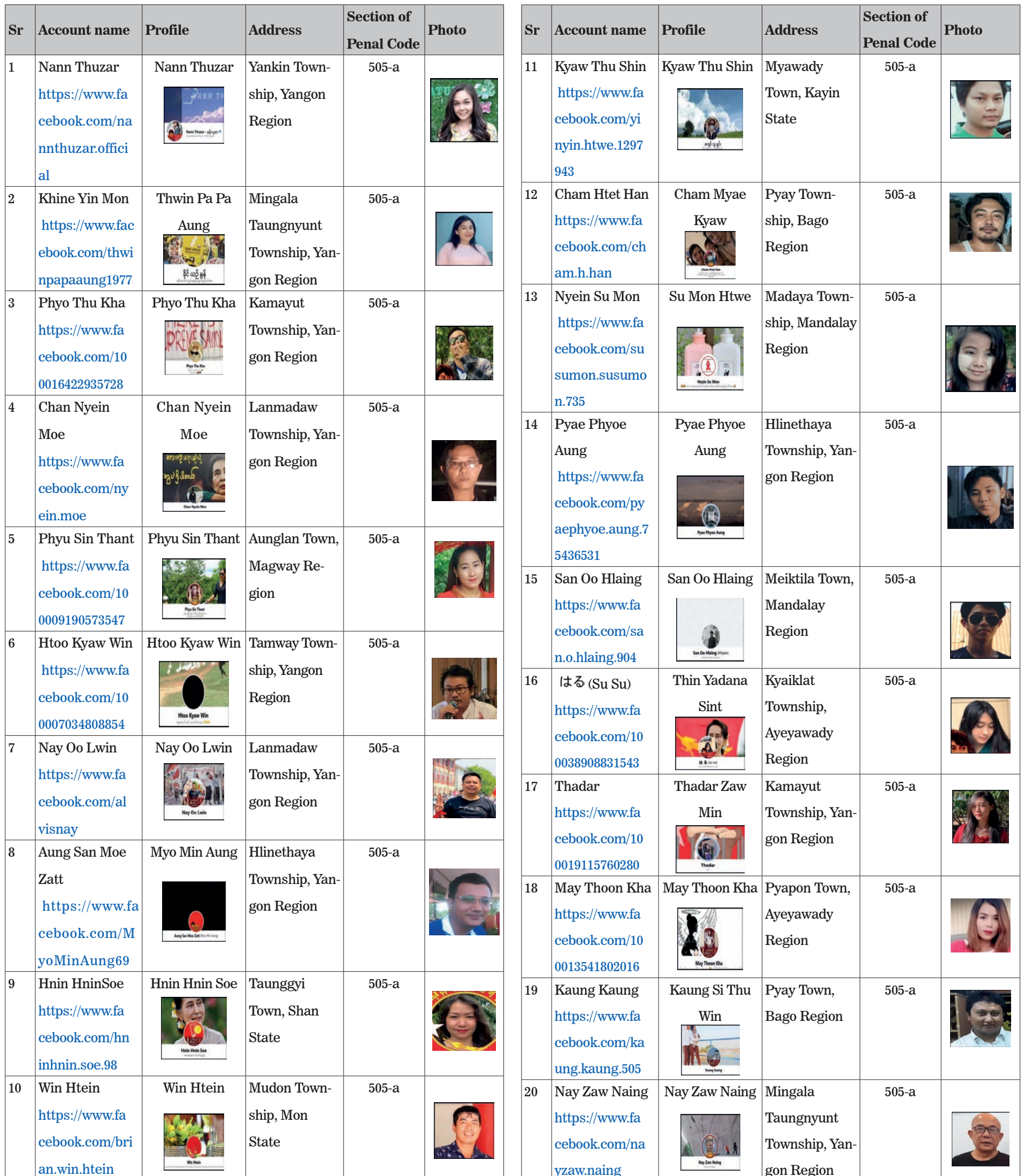
The list of people charged under Section 505-A of the Penal Code

Action will be taken against those who admit the offenders, and list of remaining offenders will be released. —MNA