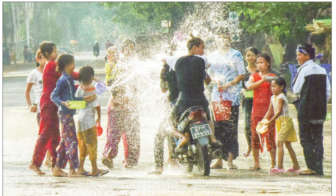
Thingyan revellers enjoy the festival in Pyinmana. PHOTO: AYE HTEIN

Myanmar Thingyan symbolizes the washing away of the previous year's ills and sins in preparation for the New Year's goodness. Sprinkling water on other people is also intended to wash away one's sins of the previous year. — Naing Aung/ GNLM