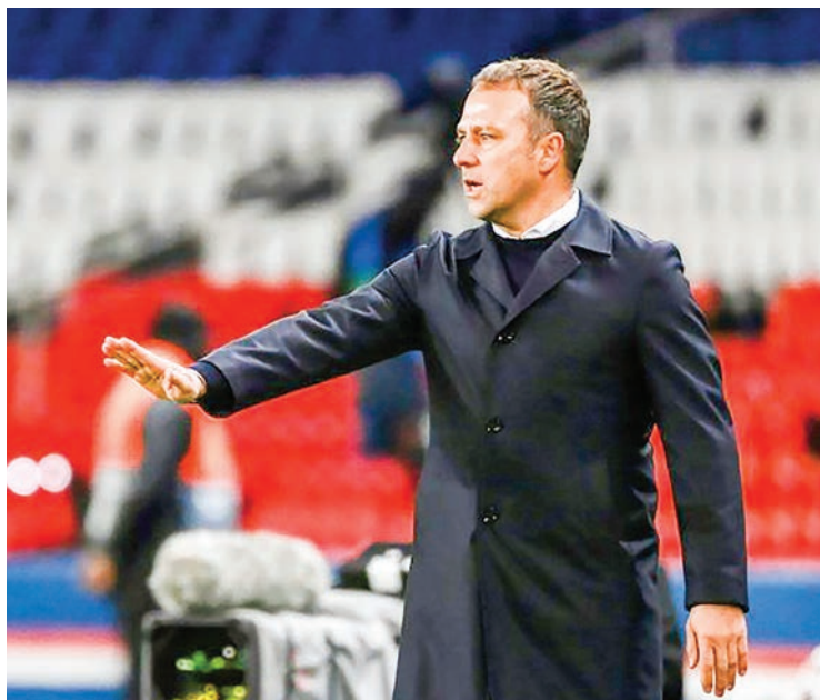
Bayern Munich head coach Hansi Flick admits he is considering his future after their Champions League elimination.

However, elimination from both the Champions League and German Cup, means only the Bundesliga is still in play with leaders Bayern five points clear and on course to win the German league for the ninth straight year.—AFP ■