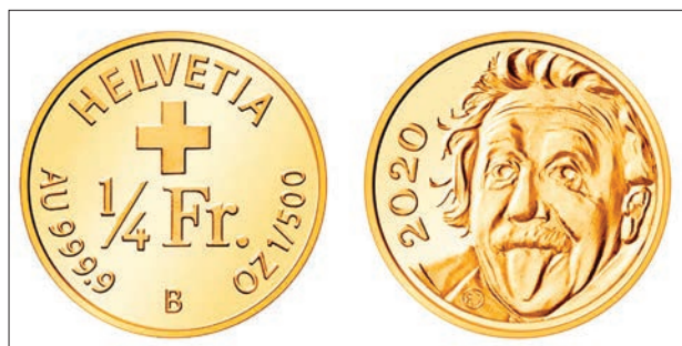
The gold quarter Swiss franc coin issued in 2020 that entered the Guinness Book of Records as the world's smallest commemorative coin.

A tiny Swiss gold coin bearing a picture of Albert Einstein sticking his tongue out has been crowned as the world's smallest com-