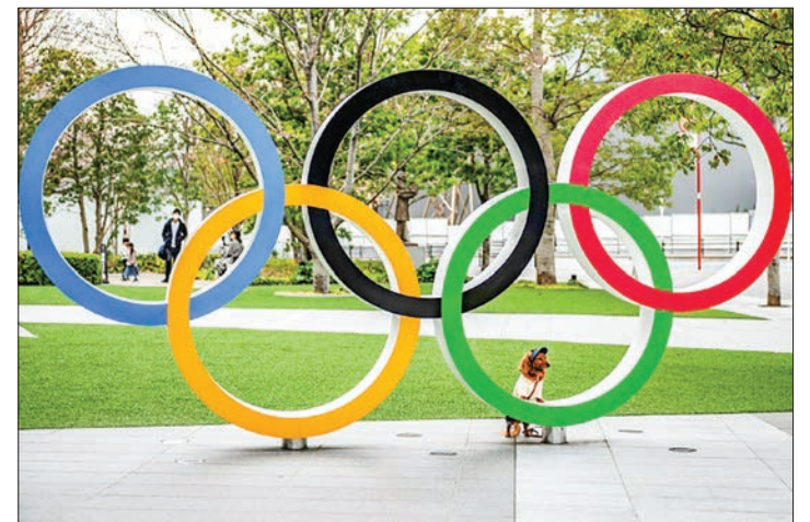
The tone from Tokyo 2020 organizers and Olympic officials is still one of confidence.

THE Olympic flame is on its way across Japan and athletes around the world are ramping up training, but 100 days before Tokyo 2020 opens, organisers still face monumental challenges. Virus surges, including in Japan, are playing havoc with preparations and fuelling uncertainty about whether the Games can, or should, happen this summer.