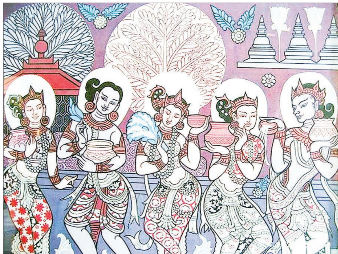
Thingyan is Myanmar New Year Festival that usually occurs in middle of April. It is a Buddhist festival celebrated over a period of four to five days. Bagan era painting of Thingyan.

There is a legend that tells us how the Thingyan festival originated. The two mighty devas (deities), Thagyar Min (Indra) and Athi Brahma were drawn into a controversy over the solution of a mathematical problem. They agreed to refer the matter to a sage called Kavalamine, whose verdict would be accepted as final. They also agreed that the winner should cut off the loser's head. The sage judged that Indra's solution was right, and so Indra cut off Athi Brahma's head. But Athi Brahma was so omnipotent, a god, that if his head were thrown down to the Earth, the Earth would burn to ashes, if thrown into