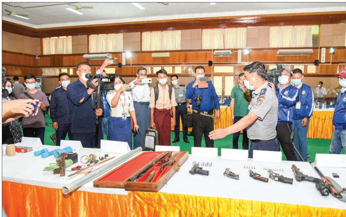
Media persons are viewing the weapons used in riots.

As for difficulties, there are schools that were set on fire because of the opening of the refresher course. He said he would like to say to the teachers that there are 50 per cent and more of the teachers who are attending the refresh-