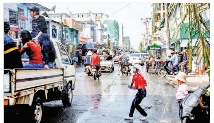
Festival revellers are seen enjoying Thingyan yesterday.

The roads in Sittway town are full of people who are celebrating the water festival as well as people in respective wards are also building traditional water pavilions and splashing water.