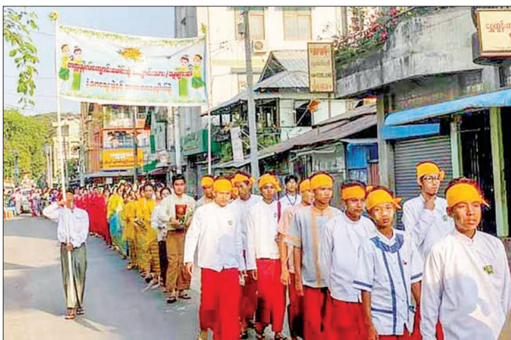
A ceremonial procession is seen for incense grinding festival and sacred bathing of Buddha images in Sittway.

STUDENTS from various universities collaborated under the leadership of the University social association (Sittway) to celebrate the Incense Grinding Festival and the ceremony of Sacred Bathing Buddha Images yesterday afternoon on 12 April in Sittway.