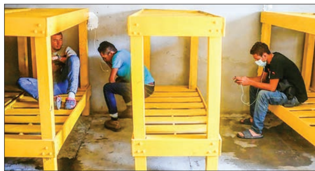
Migrants rest at a shelter in central Mexico near the railroad where they cling to freight trains on their journey to the United States.

"Yesterday I felt ill. I didn't want to eat. So