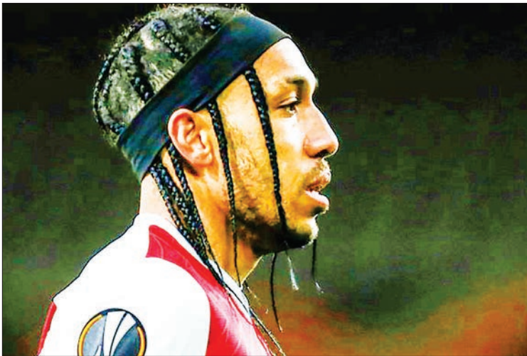
Illness - Arsenal captain Pierre-Emerick Aubameyang.

ARSENAL manager Mikel Arteta is still unsure if captain Pierre-Emerick Aubameyang and Martin Odegaard will be fit for Thursday's Europa League quarter-final second leg away to Slavia Prague.