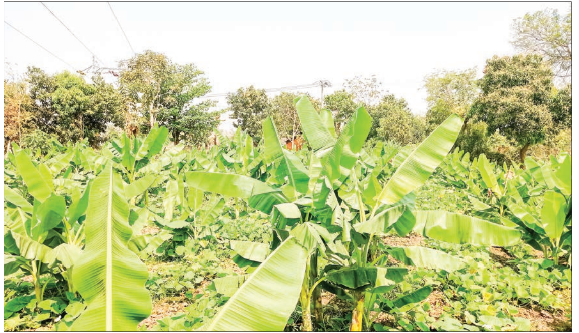
The cultivation of mixed crops of Theehmwe banana and calabash is achieving success in Minbu (Sagu) township.

The cultivation of mixed crops of Theehmwe banana and calabash is achieving success in Minbu (Sagu) township, said Daw Kay Thi, a banana grower in Kyaukton village. —Zeyar Htet (Minbu)/GNLM