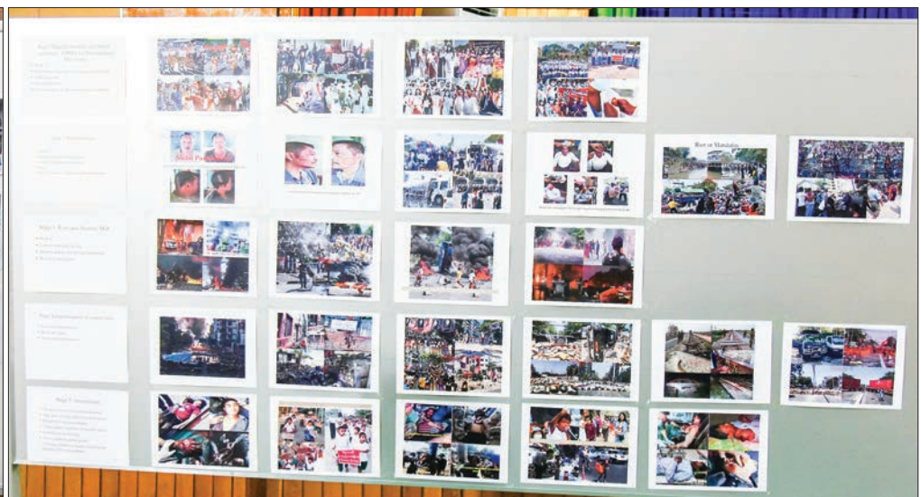
Panel displays of weapons and related items of evidence used in riotous protests and violent attacks.

er course. Some teachers are not able to come due to many difficulties such as attacking by students, but he said he believed they would absolutely succeed. As for teachers, basic education needs teaching, unlike universities, and it is a community where no self-study can be done without instruction. He would like, on behalf of the State Administration