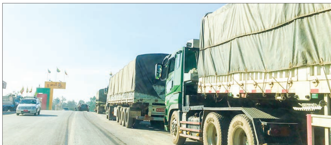
Trade value through the Muse land border plummeted to US$2.47 billion between 1 October and 2 April in the current financial year 2020-2021 from $2.6 billion recorded in the corresponding period of last FY.

“Man Wein post has been closed down since 12:30 pm of 30 March. Man Wein is the important cross-border point