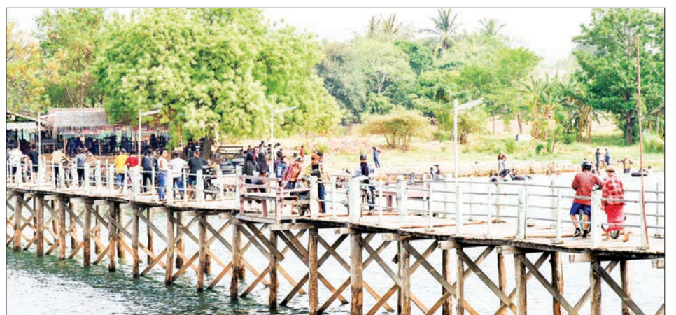
Water-throwing festival in Kyi Taung.