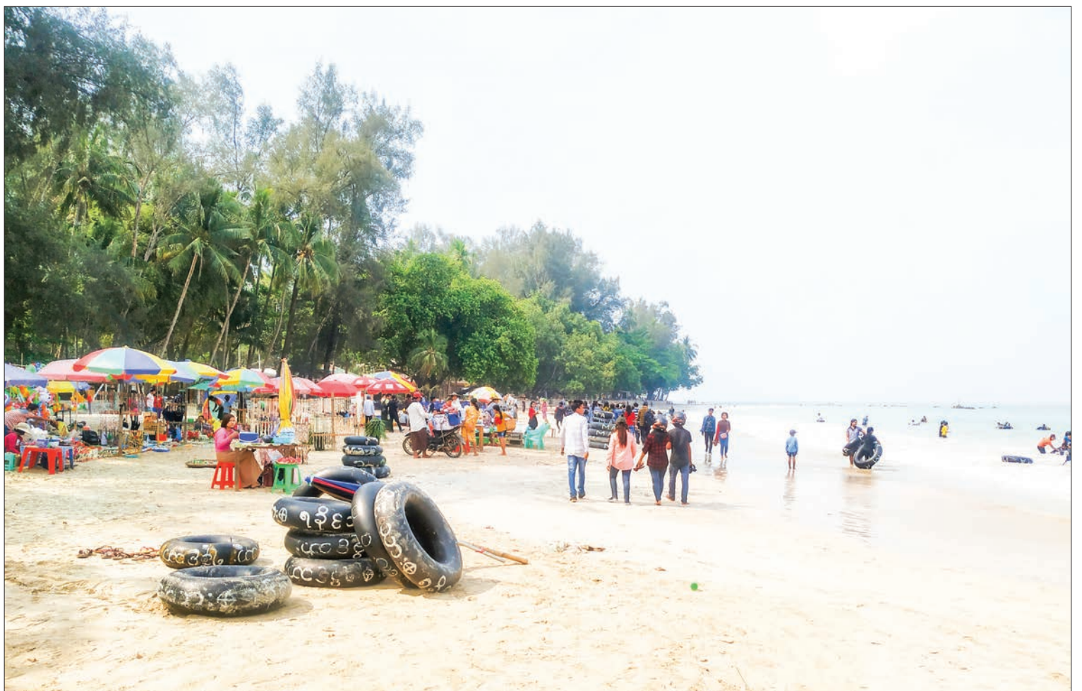
The name "Ngapali" was given to a little village in Thandwe District in 1826, after the First Anglo-Burmese War, by Italians who reached there.

Ngapali beach is a popular tourist destination and it is over 4 miles away from Thandwe town. The beach is one of the most attractive places for the local people and the foreign