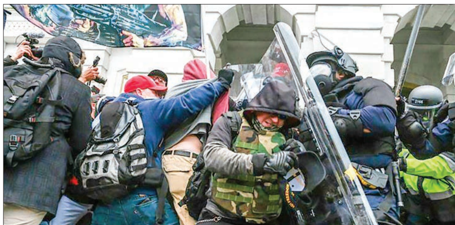
Riot police push back supporters of then-president Donald Trump on January 6, 2021 after they attacked the Capitol building in Washington.

to prepare properly even though they had intelligence warnings that Trump supporters who believed his claims that the November election was stolen