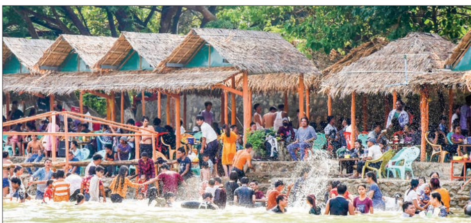
Water-splashing festival in Hlay Khwin Taung.