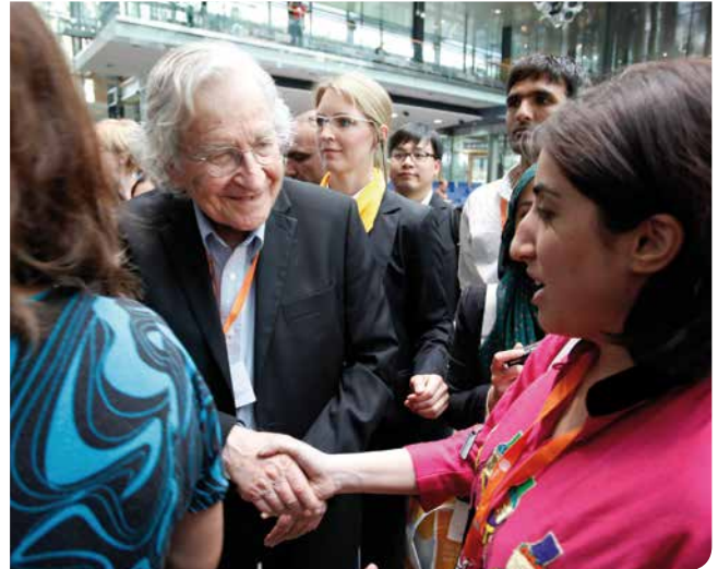
Prof. Avram Noam Chomsky Linguist, Philosopher and Political Critic, Professor (Emeritus) Massachusetts Institute of Technology, Boston, United States

It's very simple. I'd like the press to tell the truth about important things.