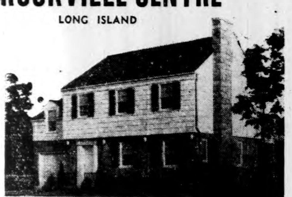
COME OUT AND INSPECT A TRULY WELL BUILT HOME IN A TOWN WHERE THERE ARE NO ASSESSMENTS

finest of materials, complete in every detail, and modern yet not extreme. Situated be agreeably surprised by its grace of archi-tecture and spaciousness of rooms. The exte-rior is of massive Westchester stone and heavy shinales. There is an attached garage, with overhead door. The lawn is seeded and amply shrubbed. There are curbs and sidewalks and flagstone walk to house. The interior, which consists of a living room [4x22] has a large artistic log-barning fireplace with bookeases on each side; cheerful dining room with door leading to large ones back. leading to large open perch: much care has been stressed in layout of kitchen; more than enough closet suace has been provided; it is equipped with latest Oriole gas range, heavy Inlaid linoleum, refrigerator space; breakfast