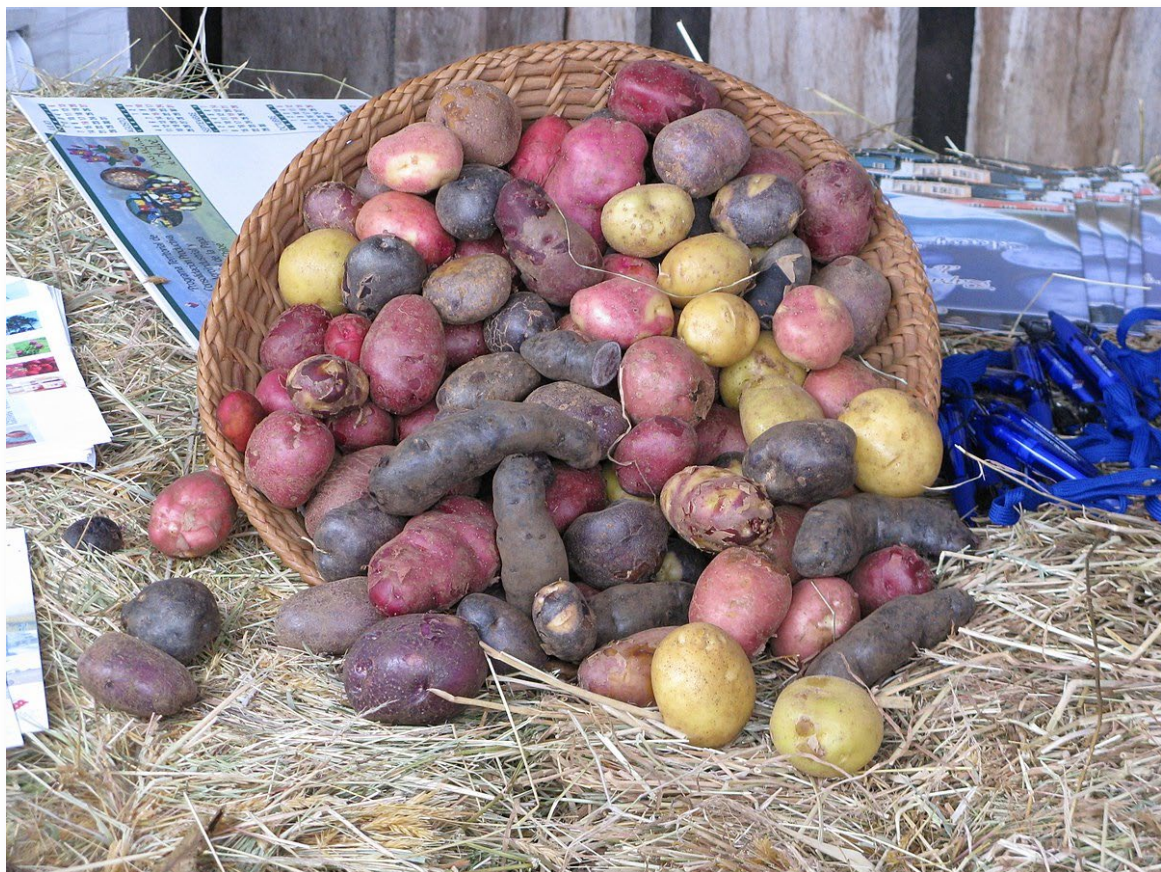
"A selection of Chiloé's roughly 400 native varieties of potatoes".

The Treaty is also crucial because of inter-country interdependence. For example, what happened in Ireland in the 1940s, when potato crops, which was the national staple food, were attacked by a fungus, the Phytophthora infestans . The famine that followed is considered one of the greatest catastrophes in European history as it caused the death of some two million people. But what was the underlying problem? Why was it impossible to cope with the disease? The answer is simple and brings us back to the dangerous concept of uniformity: at the end of the 1500s, a handful of uniform varieties of potatoes were introduced into Ireland. And it is because of that uniformity that the Phytophthora fungus was able to spread easily. The conquistadors had only brought that one variety. At that point, how could this problem that threatened the rest of Europe be solved? European agronomists had to return to Latin America, and precisely to Peru, to find other diverse resistant varieties to eradicate the disease. But this is not an old story.