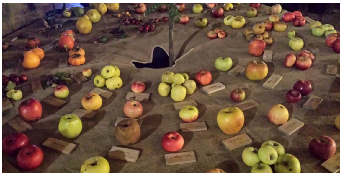
Apple diversity, Italy

Nor do we have the right nourishment in industrial products whose production does not respect the environment, as territories are poisoned and biodiversity destroyed, while products travel thousands of kilometres and are full of chemicals. In Europe we are spending 700 million euros a year on diseases caused by junk food. The problem is that farmers are disappearing because they cannot compete with an industrial agriculture that does not pay for externalities. And with what results? Much more than we need is being produced but people are still dying of hunger or diseases caused by poor nutrition. A third of the food produced is also being thrown away. In Spain, each inhabitant throws away an average of 160 kilos of food per year. The employment factor is also affected. Today in Spain only 2.5% of the population works in agriculture and unemployment rates are sky-high. The employment factor is also an externality of the agribusiness system. In short, for every euro we pay in the agribusiness market, we pay two euros plus tax to reduce the negative effects. The real price of the food we buy is three times higher. We must reverse this situation, starting with the elimination of subsidies to industrial agriculture.