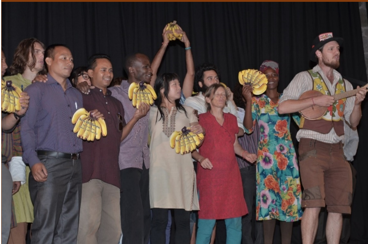
No GMO Banana Campaign – Navdanya / Seed Freedom, 2014

In addition to succeeding in stopping the Gates GMO banana from being imposed on India, these international campaigns against GMO Bananas 8 served to connect the issues of GMOs, Biopiracy, and the ethical violations of human trials by connecting movements in Asia, Africa, Australia and the US. It helped expose the colonialist mindset behind the project and the multiple human rights issues connected with it. The campaign also showed the absurdity of GMO bananas when there are so many more effective solutions to issues of nutritional and iron deficiencies