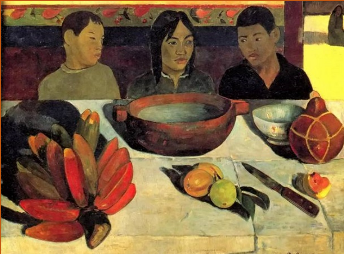
Paul Gauguin, Le Repas (The Meal), 1891