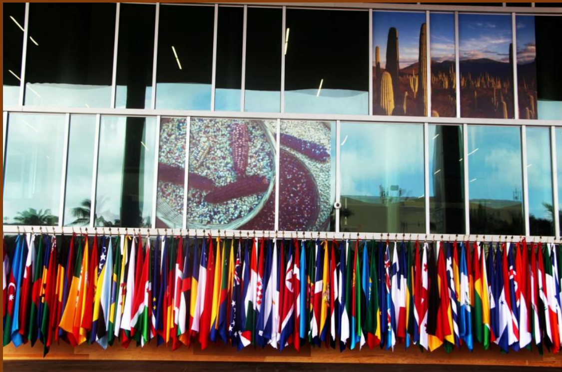
COP13 - Convention on Biological Diversity.

Gates, and his push to digitalise every aspect of life, undermines the CBD and the FAO Seed Treaty through Digital Sequence Information (DSI) 5 and patents based on digital genome mapping.