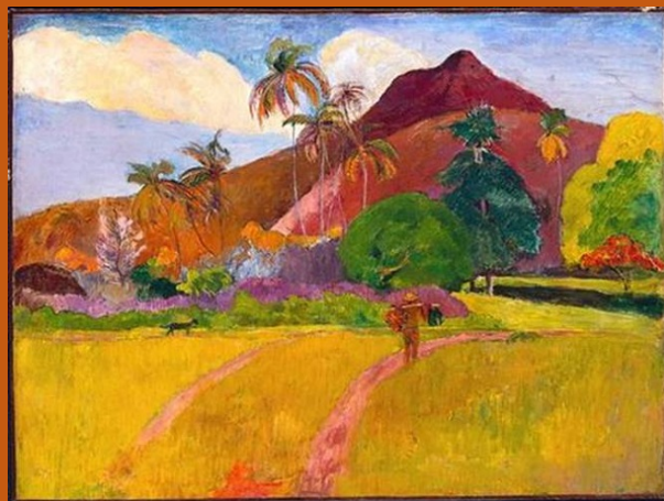
Paul Gauguin, (Tahitian Landscape), 1891