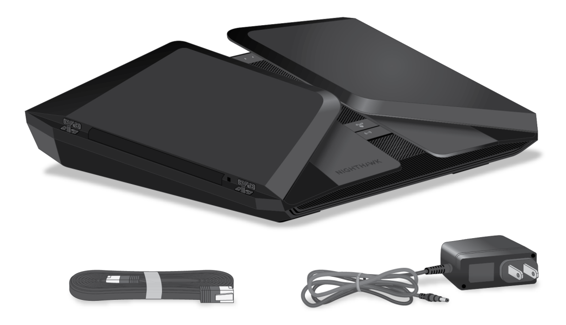
Figure 1. Package contents

Your package contains the router, the power adapter, and an Ethernet cable.