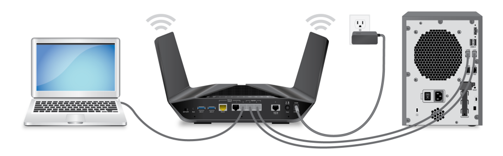
Figure 9. Ethernet port aggregation to a LAN device

WARNING: Do not connect an unmanaged switch to Ethernet ports 3 and 4 on your router if these ports are aggregated. Otherwise, a network loop occurs, and your network might be shut down.