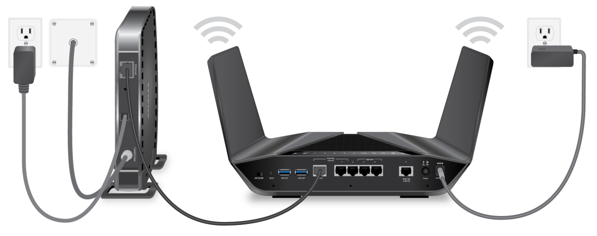
Figure 7. Router connected to a modem

After you connected your router to a modem and powered it on, finish your router's installation process using the Nighthawk app or router web interface. For more information, see <u>Connect to the Network and Access the Router</u> on page 19.