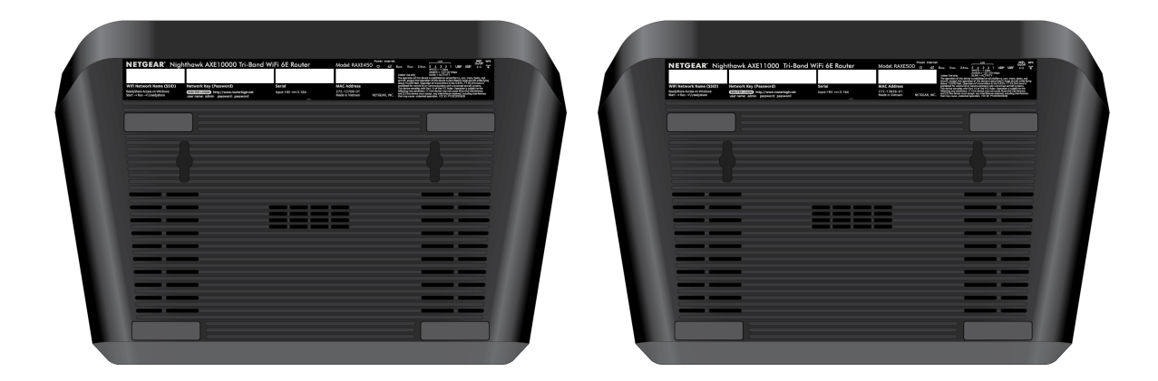
Figure 8. Bottom of the RAXE450 router and RAXE500 router

Note: We recommend using M3 x 20 mm screws.