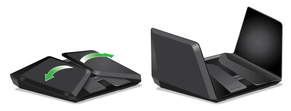
Figure 6. Position the antennas

Before you install your router, extend the antennas as shown in the following figure.