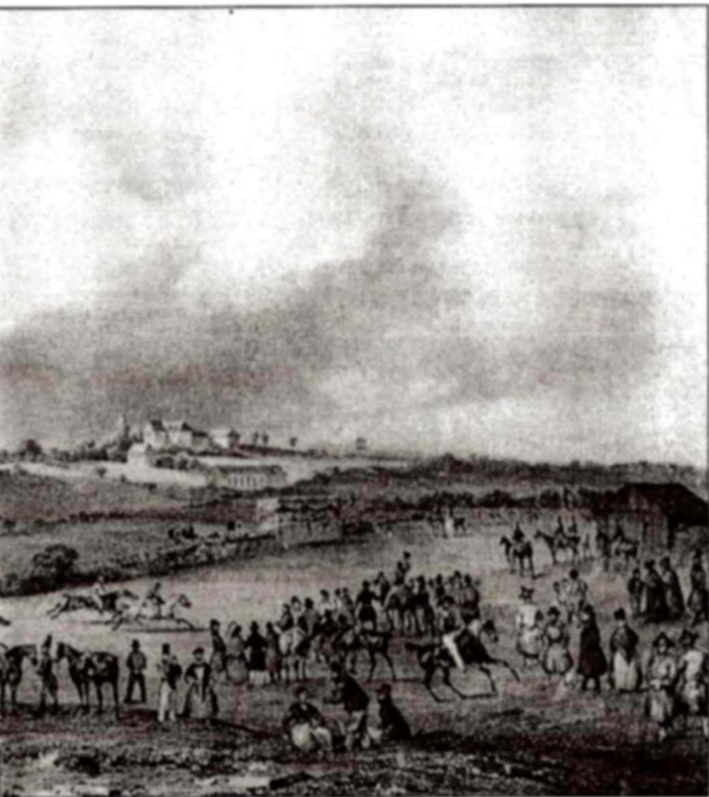
'COURSES DE CHEVAUX A LONG-WOOD (Ile S te Hélène)'