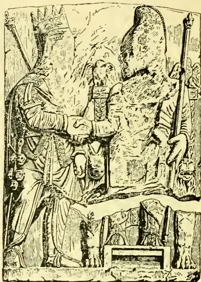
AHURA MAZDA AND ARTAGENES.

(Bas-relief of the colossal temple built by Antiochus I. (69-34 B.C.) on the Nemrod Dagh, a spur of the Taurus Mountains. 1 )