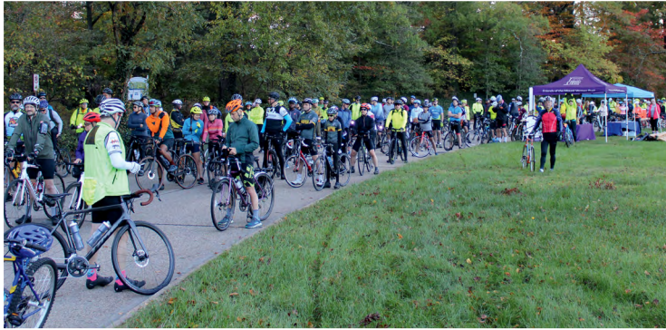
Tour de Mount Vernon 2023