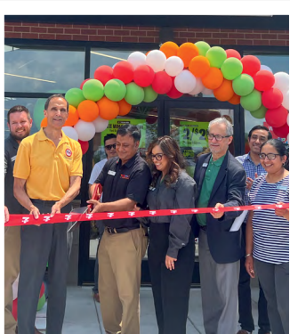
7-11 Lukens Lane Grand Opening