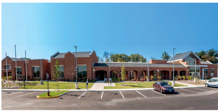
Lorton Police Station & Animal Shelter Grand Opening