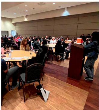
Mobile Home Coalition Community Meeting