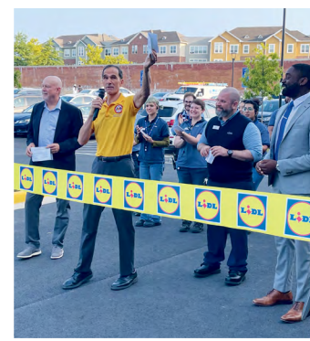
Lidl Lorton Grand Opening