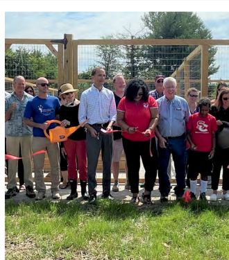
Laurel Hill Community Gardens Ribbon Cutting