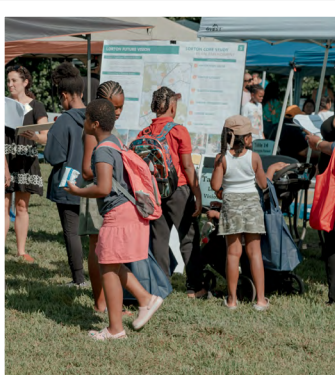
Back-to-School Community Day