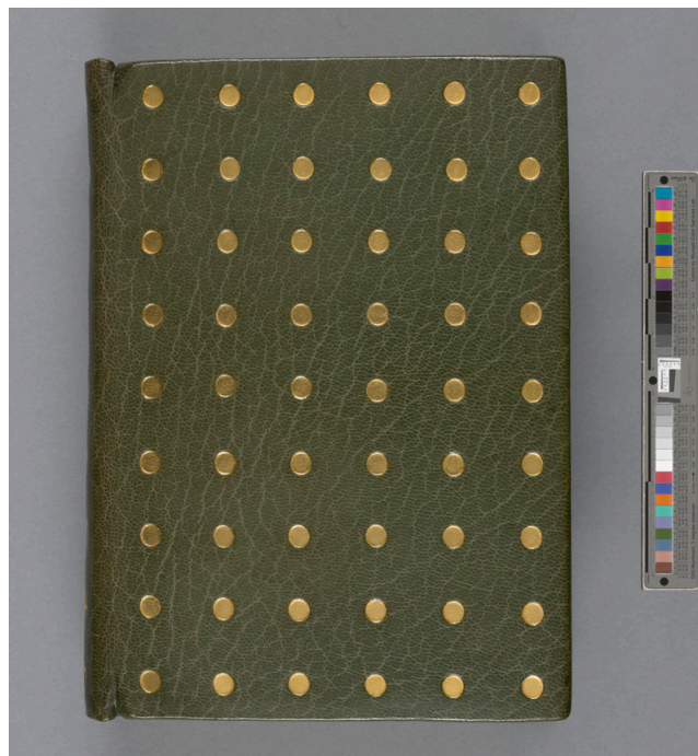
Fig. 5. Marguerite Duprez Lahey and Catholic Church, Book of Hours , record 121468, text ca. 1415, binding 1951, full leather binding with gold tooling, front cover. Morgan Library & Museum, New York, NY, USA.

The volumes Morgan published on his collection of porcelain, Chinese Porcelains (PML 77706 and 77707) were both bound in a simple full-leather binding of “Chinese yellow,” with the Morgan crest gold tooled on the covers. 40 The boards open to reveal elaborate leather doublures 41 composed of several panels of differently colored leather, and gold-tooled symbols of “the emperors of the Ming Dynasty, the period in which the greatest Chinese vases were produced” (Figure 4). 42 Duprez Lahey must have had these tools custom-made only for this book, taking the symbols themselves off the bases of the porcelain objects themselves. 43 The center panel of the doublures comprises a geometrical gold-tooled pattern that gives a sense of three-dimensionality to the surface. This is enhanced by the fly-leaf, which itself is formed of yellow moiré fabric adhered to paper. The patterning evokes the three-dimensionality of the Chinese porcelain, while the Chinese symbols and the colors used create a sense of exoticism.