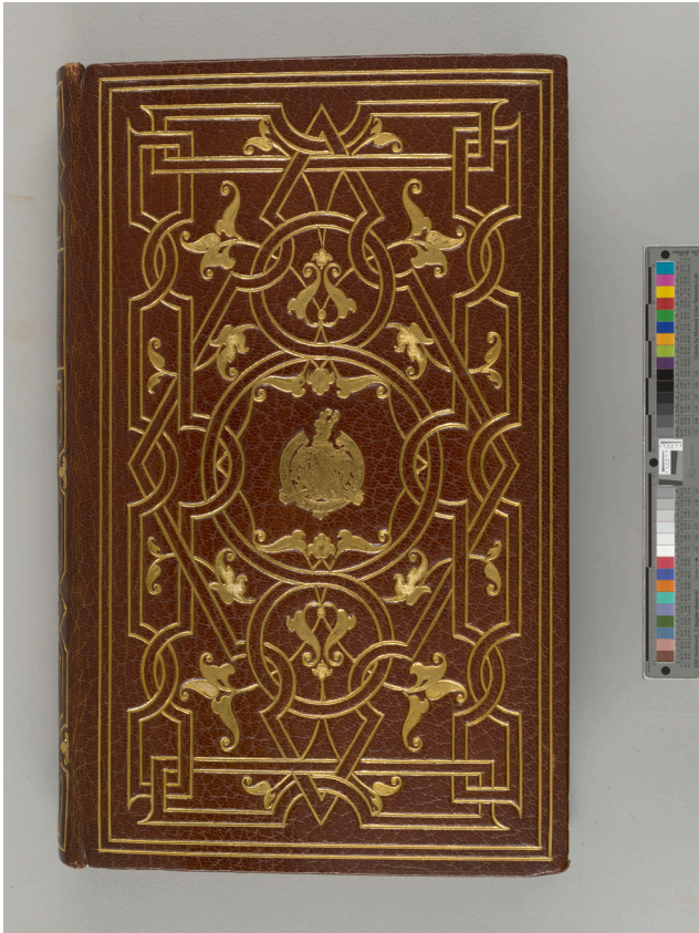
Fig. 1. Marguerite Duprez Lahey and Catholic Church, Book of Hours , record 110865, text ca. 1507, binding dated 1925, full leather binding with gold tooling, front cover. Morgan Library & Museum, New York, NY, USA.

All of these characteristics are representative of the time in which Duprez Lahey was practicing. Leather covers, for instance, reflect the understanding of library preservation practices at the time. The Librarian of Congress, Ainsworth R. Spofford, wrote as early as 1876 that “The combined experience of librarians establishes the fact that leather binding only can be depended on for any use but the most ephemeral.” 27 Leather was widely acknowledged to be the most durable binding material. However, there was a simultaneous awareness of the detrimental impact of contemporary leather manufacturing practices: “Leather, more than any other material entering into bookbinding, needs careful watching . . . leather should be subjected to the severest test, since much of it is spoiled for the purpose for which it is made by the ingredients used in its preparation.” 28 It is not, therefore, surprising that Duprez Lahey not only used leather extensively, especially to cover ‘weak’ areas such as the spine and the joints of the book, but also took great care over the origins of the leather, claiming that there was “no leather like French levant moroquin du Cap . . . [the] skin of a goat, indigenous to