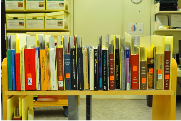
Fig. 2. A full shelf of books interleaved with fluted board on a cart.

board. Figure 2 shows a full shelf of interleaved books on a cart. Using carts allows more books to be set up for air-drying in the available space. Trucks can also be rotated and moved easily, such as for positioning them in front of fans at varying intervals.