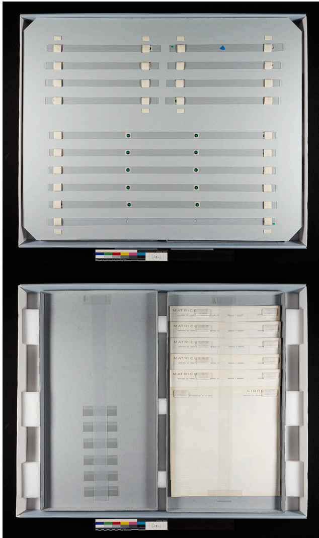
Fig. 4. (Top) upper level of storage box showing Vivak® strips with embedded magnets secured with twill tape; (Bottom) lower level of storage box showing removable trays holding folios with Mylar clips and polyethylene strap.

CHRISTINA TAYLOR C. E. Horton Fellow, Paper Conservation Museum of Fine Arts, Houston Houston, TX ctaylor@mfa.org