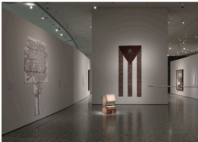
Fig. 1. Installation view of Contingent Beauty: Contemporary Art from Latin America , 11/22/2015-2/28/2016 at the Museum of Fine Arts, Houston. (Left) Johanna Calle, Perímetros (Urapán) , 2012, typed text on notarial ledger book paper, 280 x 200 cm.

display wall in locations that corresponded to the magnets in the Vivak® strips. A Vivak® template, with holes drilled in the same locations as the magnet-embedded strips, simplified positioning the metal screws during installation. The folios were hung along the top edge, allowing the bottom of the sheet to hang freely (a preference of both the artist and curator). When de-installed, the Vivak® strips were removed, the pockets were kept on the verso of the work, and all components were stored in a compact storage housing constructed from common archival storage materials (fig. 4).