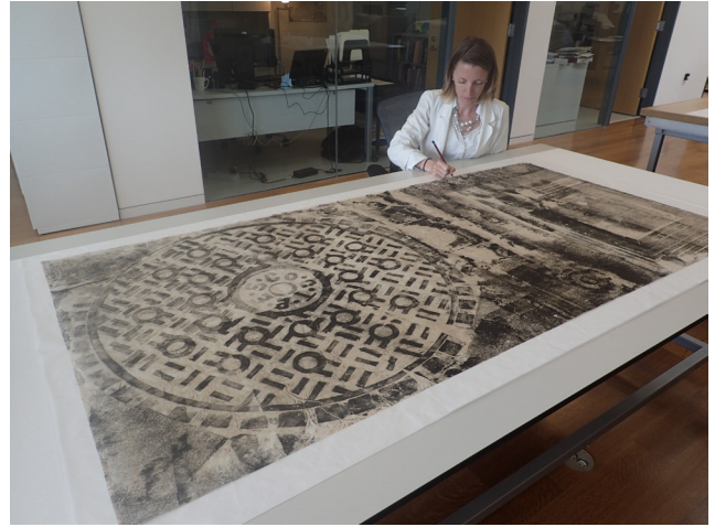
Fig. 8. Inpainting losses to design with pastel pencils on fills made from toned Hanji 1301.