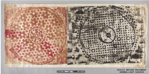
Fig. 10. Sari Dienes, Esco , 1953, black and red inks on Webril with gauze mounted overall to lining cloth, 106.36 x 238.13 cm, 2016.211, before treatment.

Webril and paper to illustrate the difference in image quality based upon the different supports (figs. 12, 13).