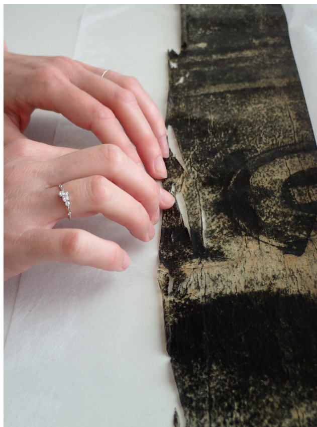
Fig. 5. Realigning tears along the edges of Marcy .