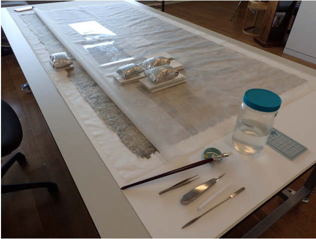
Fig. 6. Mending Marcy with Hanji 1101 and 4% methyl cellulose A4C.

the mount is considered original to the object and should not be removed, despite treatment limitations imposed by the secondary support. Fortunately, Pollitt provided samples of the secondary support material for testing purposes. Once the materials are identified and treatment options are tested, a treatment strategy will be established for Esco .