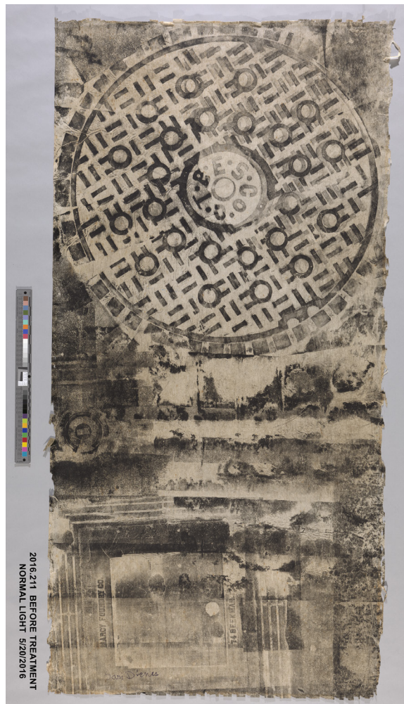
Fig. 2. Sari Dienes, Marcy , 1953, black ink on Webril, 181.29 × 90.17 cm, 2016.227, before treatment.