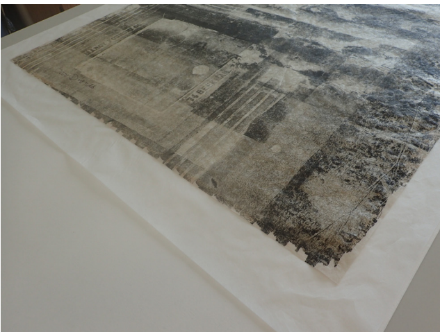
Fig. 7. Inserts made from acrylic toned Hanji 1301 to fill losses in Webril.