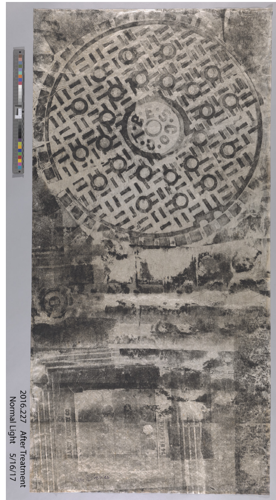
Fig. 9. Marcy , after treatment.