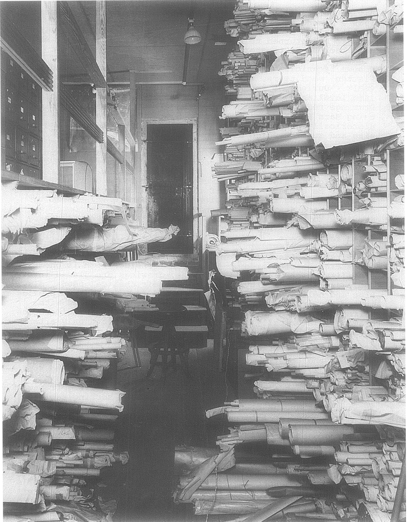
FIGURE 1 The 1992 Book and Paper Group Annual 175