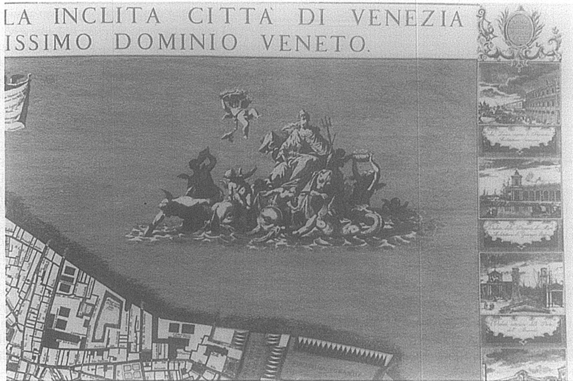
Fig. 5. "Venezia Trionfante" from the top right of the Ughi Map.