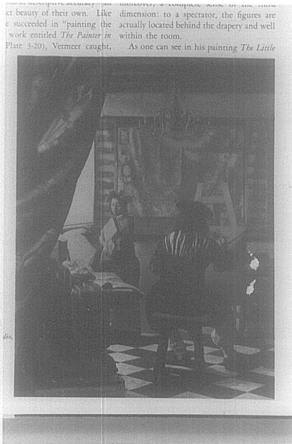
Fig. 6. Hanging wall map in the background of a Jan Vermeer Painting.

If a map is used in the hanging format, unless it is kept and handled in the gentlest way, it won't survive in this state over an extended period. The dowels tear away, the adhesive between the paper and lining fails, and the materials are damaged by the environment, insects, handling, and rolled storage.