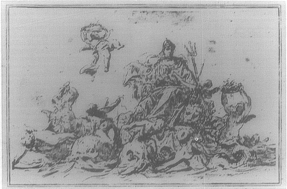
Fig. 4. Drawing of "Venezia Trionfante" by Sebastiano Ricci from Zanetti album.