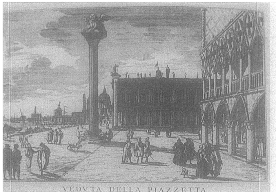
Fig. 3. View of the Piazzetta engraved by Luca Carlevarijs from the series "Fabriche e Vedute di Venetia."