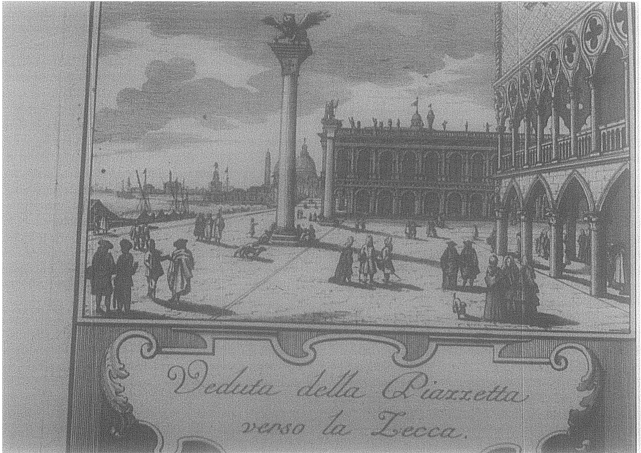
Fig. 2. Flanking View of the Piazzetta from the Ughi Map, possibly by Francesco Zucchi, directly copied from Carlevarijs.