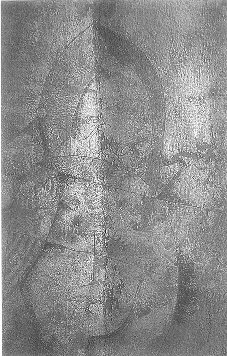
Fig. 3. Detail of Black Sun in raking light illustrating flaking and losses

Gallery is actually made up of two polypropylene reducing connectors, that fit the diameter of the tubing. The larger connector is a good size and shape and can be held comfortably like a pencil. This particular configuration does not seem to drip as much as the single small nozzle does, which is an important consideration. Mist collects in the tubing or nozzle and forms droplets, which can land on the object if one is not vigilant. The nozzle must be constantly monitored for dripping throughout the treatment. It is good practice to have a blotter square handy, or to automatically press the nozzle to the blotter every few minutes. The conservators at CCI take the added precaution of wrapping the nozzle with chromatography paper before inserting it into the