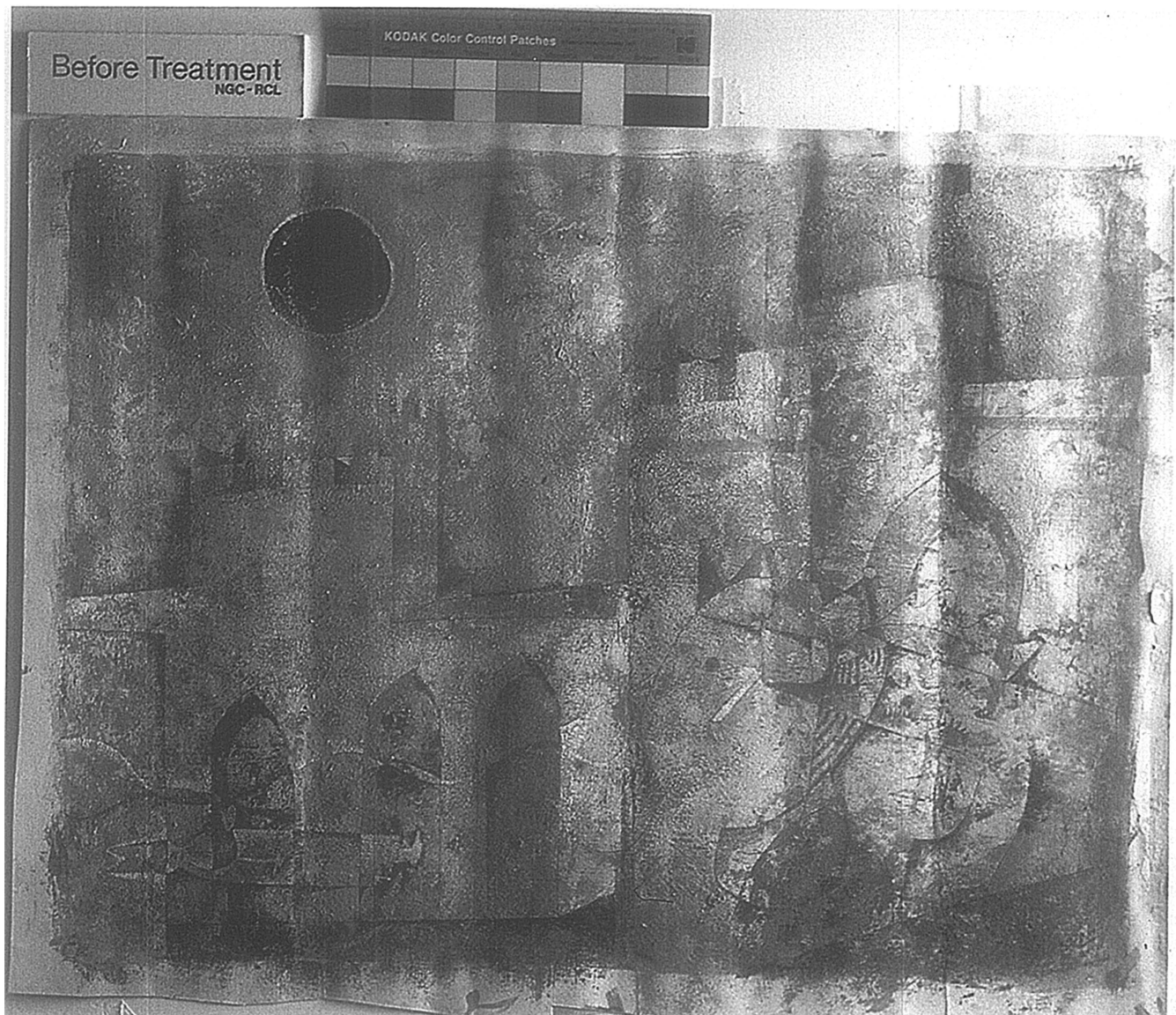
Fig. 2. Black Sun , gouache on paper by Michael Snow. Before treatment, raking light

Transparent tubing is used to connect the compressed air to the bottle, and to deliver the mist to the handpiece. If using organic solvents, a platinum-treated silicone tubing should be used to avoid possible contamination of the object being misted with extractables in the tubing. 1 The handpiece used at the National