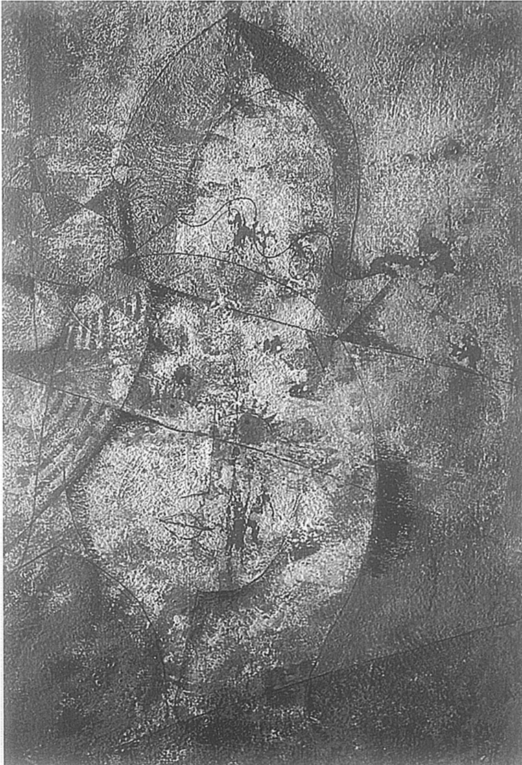
Fig. 5. Detail of Black Sun in raking light after treatment

up was humidifying, the ultrasonic mister was set up with the chosen consolidant and adjusted. The mock-up was then transferred to the suction table and placed under medium suction.