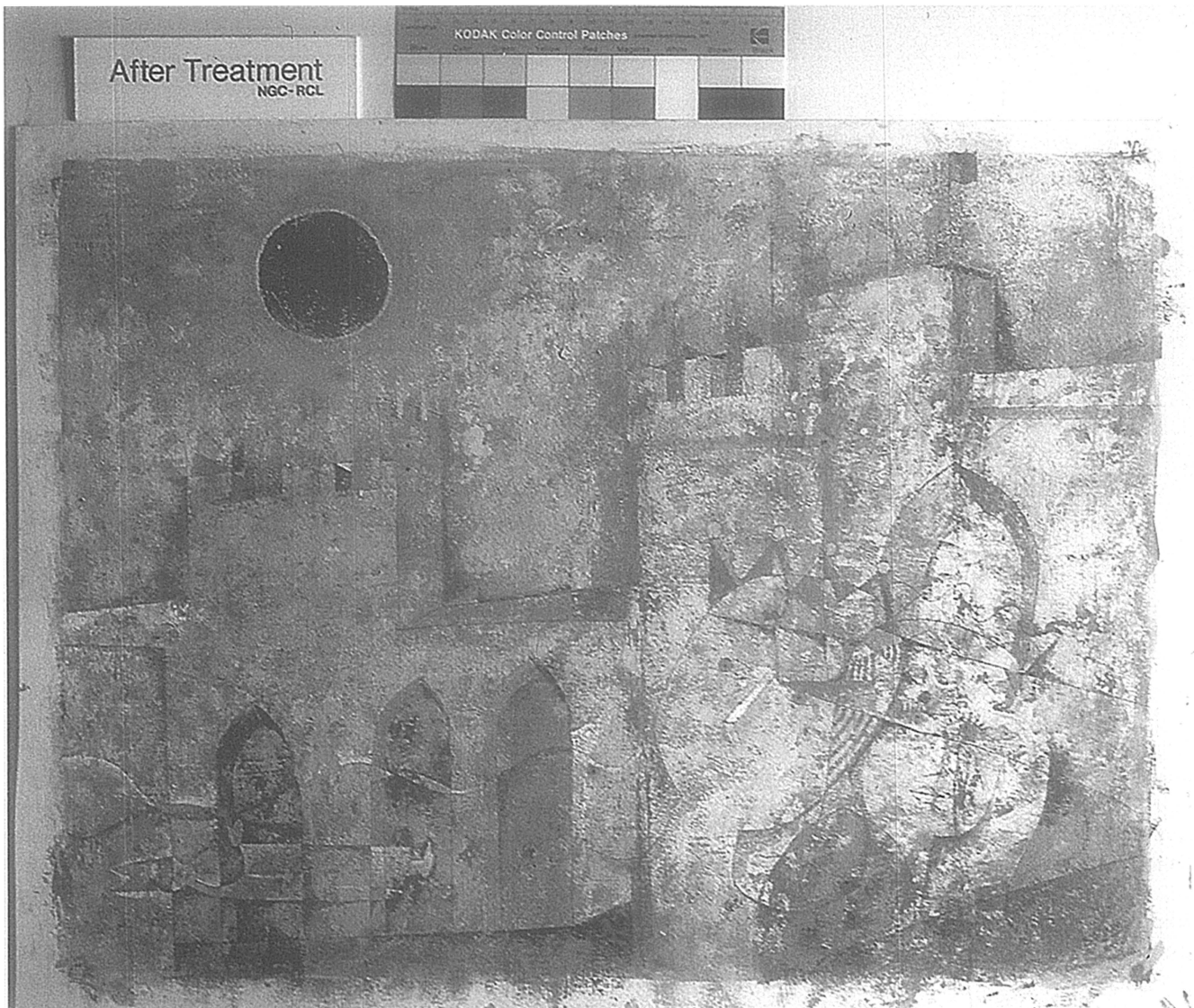
Fig. 4. Black Sun , after treatment, raking light

For testing, the following consolidants were prepared at the following concentrations, with mixed success in mistability: