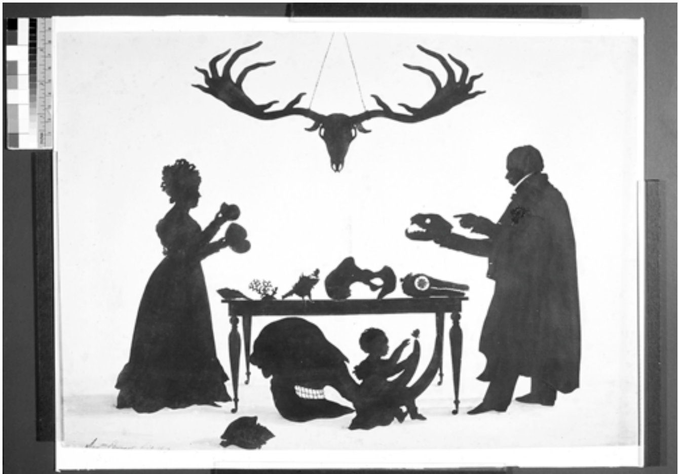
Fig. 4. Example of a conversation piece silhouette. Auguste Amant Constant Fidèle Edouart (France, 1789-1861), William Buckland and his Wife and Son Frank, Examining Buckland's Natural History Collection , c. 1828-9. Cut-out full-figure silhouettes from matte black coated white wove paper mounted to beige wove paper. Mary L. Smith Fund, Museum of Fine Arts, Boston, 1966.964.

evangelical minister, expounded the belief that moral and spiritual character could be studied in the human face and the most accurate vehicle for examining the countenance was through the machine-traced silhouette. 26 The first American edition of Lavater's treatise was published in Boston in 1794. Six years later a celebrated abridgment was printed, The Pocket Lavater . These publications helped spread Lavater's theories and, in turn, further popularized the silhouette.