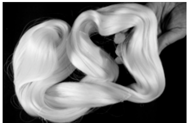
Fig. 1. Skein of hair silk.

Hair silk is sold in a skein (fig. 1). To prevent tangles and numerous short ends over time, the skein keeps better if it is cut in one place and made into a long braid from which one strand can be easily pulled at a time (fig. 2). Cutting to create the braid might only be problematic if very long threads were required for a project.