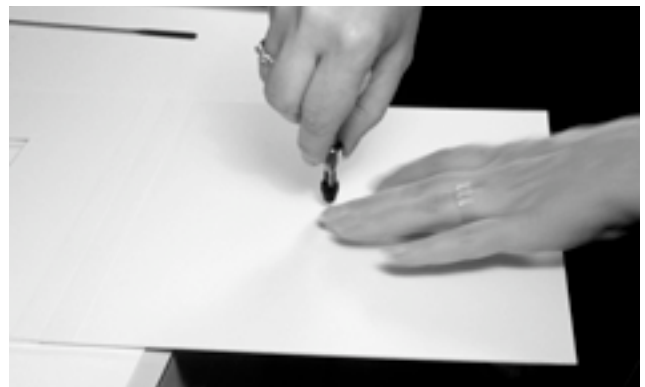
Fig. 7. Drilling holes with pin vise.