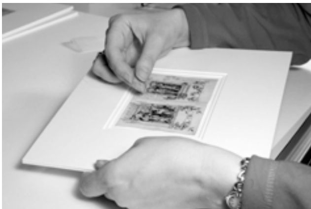
Fig. 8. Passing needle down upper hole (see fig. 4.2, Single Mount).

On the double-sided mounts, the bifolio is centered in the mat window on a small piece of glassine which can be removed midway during the mounting process as the object becomes secured.