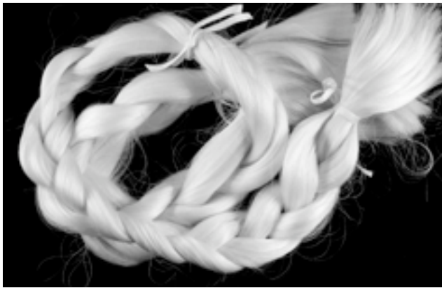
Fig. 2. Hair silk in braid form.