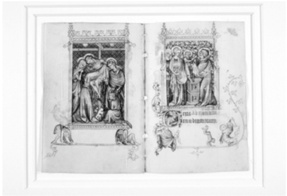
Fig. 5. Nested mount. Deposition/Presentation, Jean Pucelle, Hours of Jeanne d'Evreux ; Paris, between 1324 and 1328. The Metropolitan Museum of Art, The Cloisters Collection, 1954, 54.1.2, fols 75v-76.

the same format as single mounts. The two bifolia are stitched together on the spine fold to the backboard; the top bifolio is folded over to show the appropriate facing pages, holes are drilled for the side straps, and straps are stitched on the single side and the folded-over side (fig. 5).