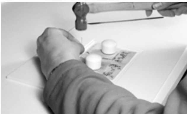
Fig. 6. Marking holes with a needle and hammer.

The object is centered and weighted in place. Holes are marked with a needle and hammer at the center of the sewing stations and close to the outside edges of the art,