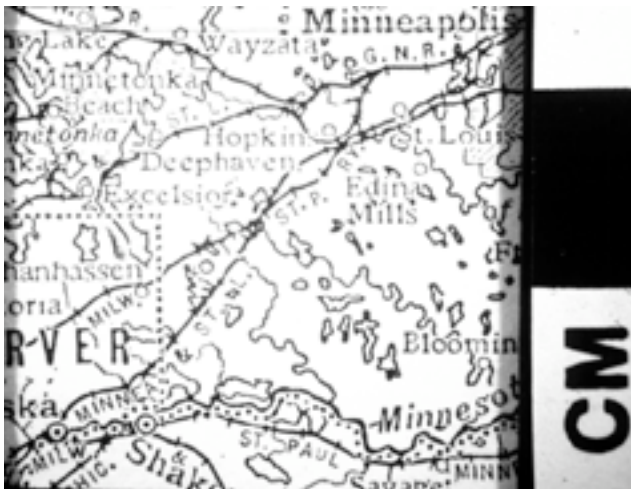
Fig. 1. Map of Minnesota engraved by Emery Walker for the Encyclopedia Britannica .

The complete wax engraving process included drawing the positive image on a wax-covered plate and then casting the master printing plate from that electrolytically. The diagram in figure 2 shows the relationship between the waxed drawing plate and the electrotype.