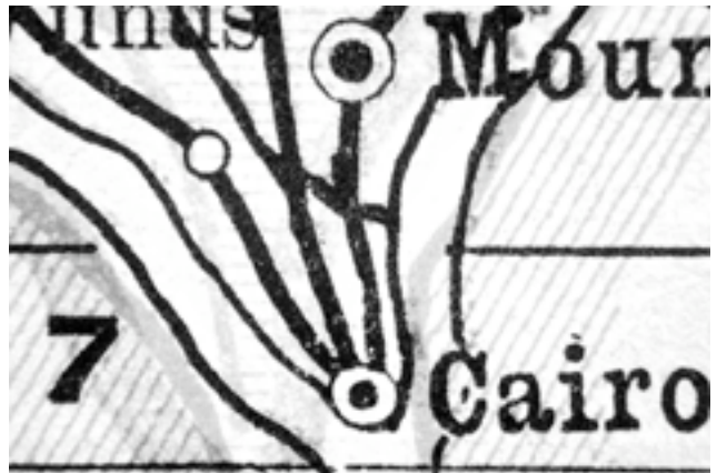
Fig. 6. Ruled tints in a wax engraving usually have a wide band around them.

Another characteristic of relief printing techniques is that they emboss the paper. Wax engraving was used primarily for commercially printed images so the paper is often not good quality. The print paper will have this characteristic impression if the printing force was great enough to emboss the paper. This will be more apparent where