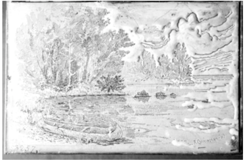
Fig. 3. Partly built up plate.

In the early maps of Sidney Morse, lettering was hand engraved. Later, type was done by stamping into the wax with commercially produced tools. In fact, the biggest competitive edge for wax engraving was that line and type could be combined in the same relief printing plate. The