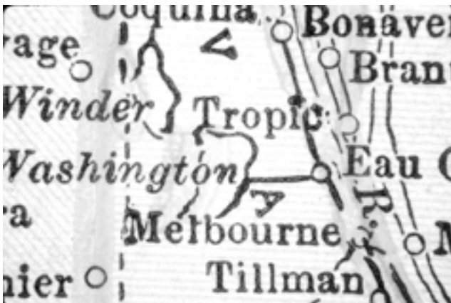
Fig. 5. The diminishing lines representing rivers are intentional; the lines of a wax engraving do not naturally vary in width.

Point symbols, like state capital and county seat marks, are sharply defined and regular in shape because they are always made with the same tool. Wax engraving could be the source of this cartographic convention and the reason we recognize the symbols so easily today. The same symbols were continued into lithographic maps. Lines that were a series of symbols such as dots, dashes, and crosses were made using tools with wheels of those symbols.