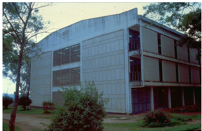
Fig. 2. MUKL main building, side view. The construction allows the air to flow freely through the building, as most of the windows located behind the lace-like concrete panels are opened.

It should be noted here that, as part of MUK, the library is meant to serve as an income generating as well as an academic support unit. It is funded by the Ugandan