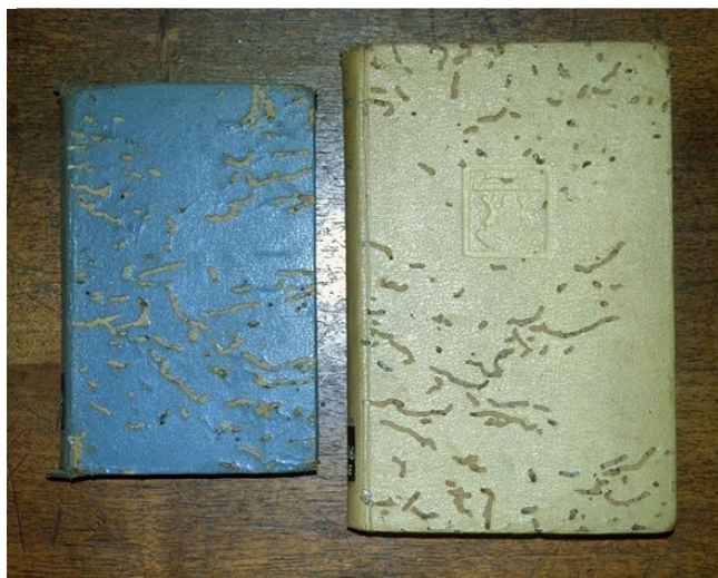
Fig. 3. Damage by insects on book covers made of strawboard. Live pests are not considered a nuisance in everyday life, and therefore are not eradicated within the library.

The classes were both theoretical and practical; whenever possible, examples were sought within the boundaries of the library. Suggestions for modifying a problematic situation always took into account the specifics of MUKL and its staff: the tropical environment, the academic setting, the limited budget, and the cultural background were always kept in mind. Handouts were distributed at the end of each one-, two-, or three-day session, serving as a basis for a small preservation documentation center. 7