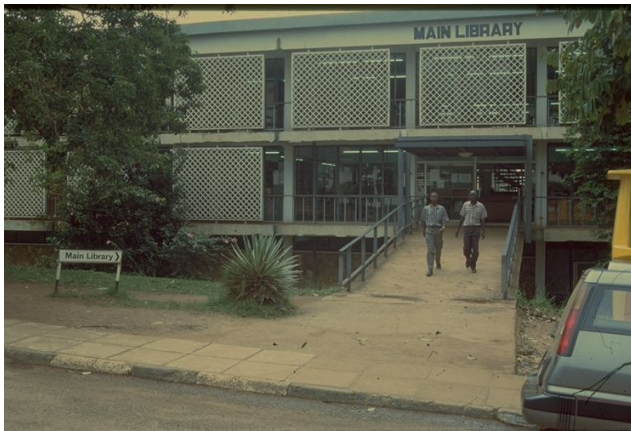
Fig. 1. Makerere University's Main Library building, front view. Notice the dust road that leads to the entrance, allowing a thick red dust to enter the library and settle on the shelves and books, disfiguring the library holdings and potentially causing abrasion.

ernment), Makerere University has somewhat resumed its regular course of activities, however still impaired by major needs in all aspects of its development. In fact, the situation described below is worsened by the very popularity of MUK, student enrollment reaching well over 22,000 whilst the facilities were initially designed for approximately 7,000.