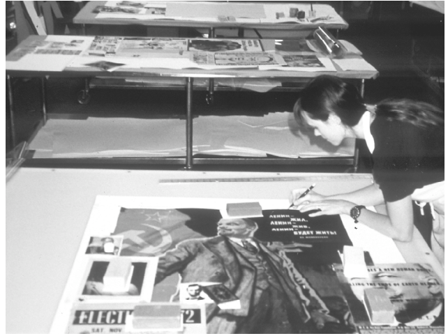
Fig. 11. Tracing outline of a section