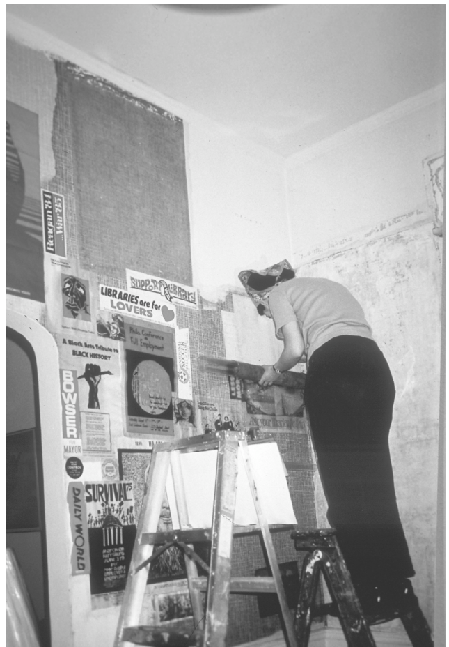
Figs. 5 and 6. Collage removal