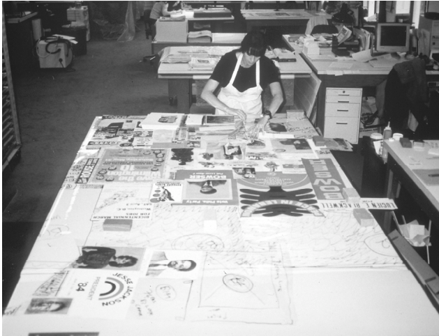
Fig. 10. Laying out collage elements