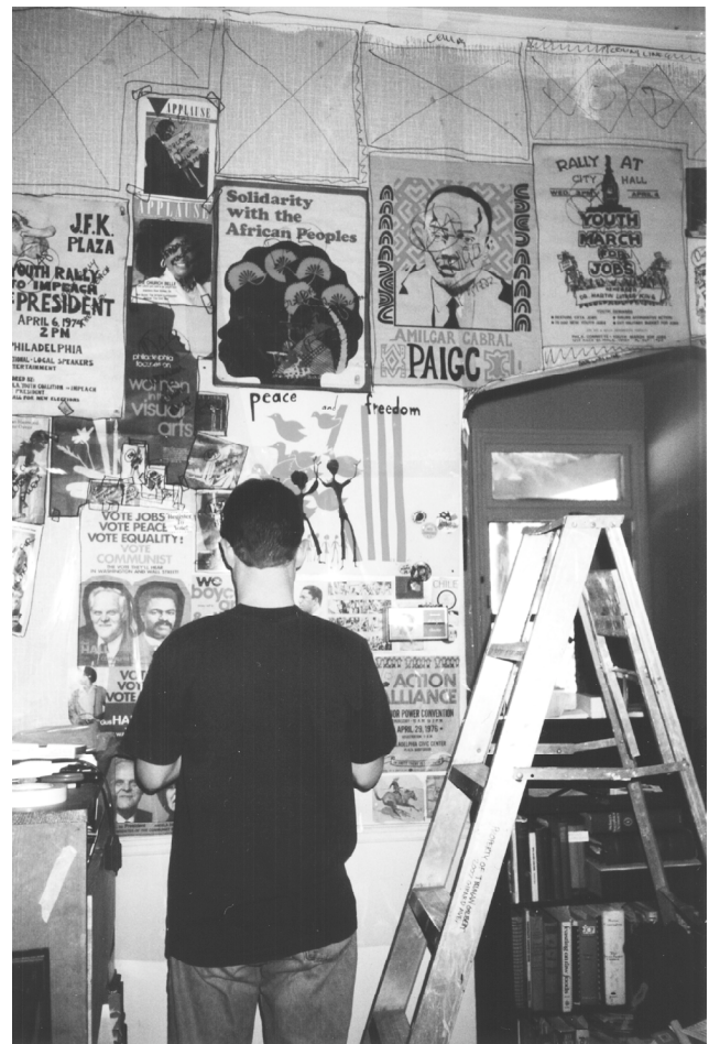
Fig. 4. Documentation

The client was informed that washing and deacidifying the poor quality collage materials would be desirable. However, due to a short time frame and a tight financial situation, extensive stabilization of the collage was not possible. The client was advised to monitor the collage over time and to limit light exposure.