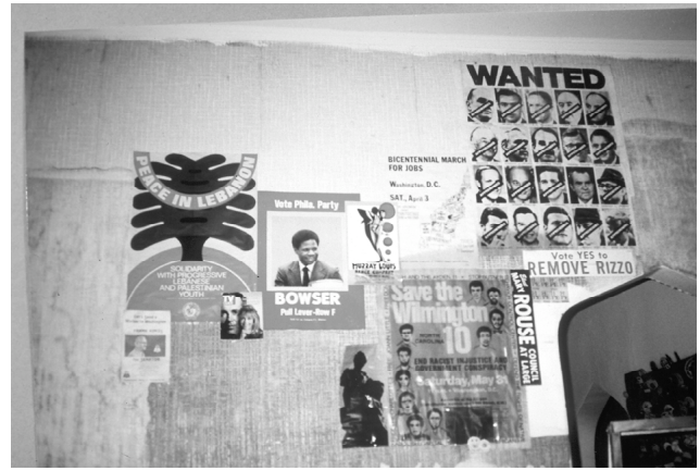
Fig. 8. Gradual removal in small sections

Another potential problem was the flattening of the collage after the bath. A certain amount of pressure was necessary to work out creases; however there was the risk of pressing the thick layer of PVA into the paper, creating a relief pattern and altering the surface of the collage. The best results were achieved by allowing the collage items to air dry and while still damp placing them between felts.