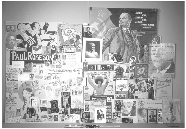
Fig. 13. After treatment: two completed panels

warp when handled. My attention was drawn to alkaline corrugated board. 2 In sheets of four by six feet, this lightweight yet stiff material fulfilled all of the characteristics I was looking for. Besides its archival qualities, corrugated board is stable enough to withstand travel and handling and is easy to cut. My only concern was that the thickness of the board combined with the Velcro would make the panels stand almost one half inch off the wall. This effect might look quite awkward. This was not a concern for the exhibit designer, other than that the reconstructed dining room needed to be slightly larger to accommodate the additional space.