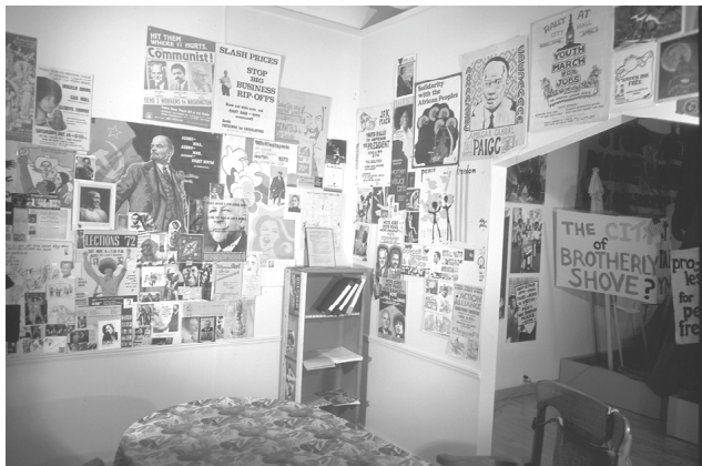
Fig. 14. The Crawfords' dining room in exhibit, after treatment

ty of the artist's materials. Since time and financial factors were predominant, the decision was already made. New pressure-sensitive tapes were simply applied over the old sliced tapes.