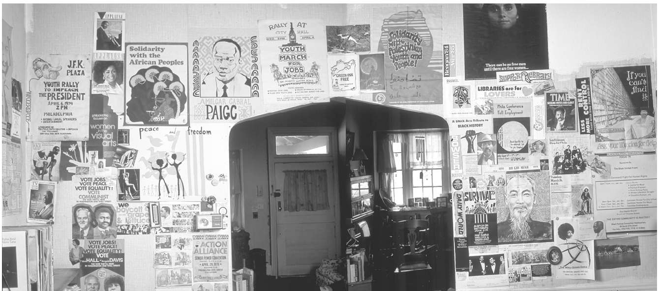
Fig. 2. The Crawford's dining room collage, before treatment

The goal of the conservation treatment was to safely remove the collage elements and remount them in their original configuration without changing the general appearance of the collage.