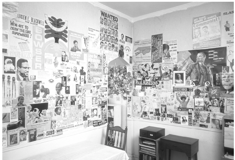
Fig. 15. The dining room: before treatment