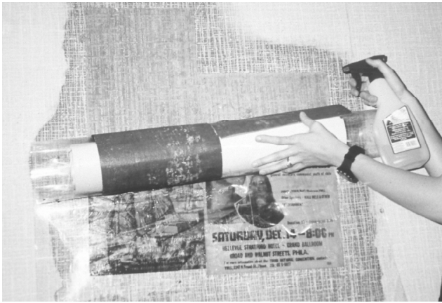
Fig. 7. Collage removal using cardstock support

It appeared that through wet treatment we were able to remove the collage, but at the same time it caused a number of problems. Time was running out and the collage needed to be removed. I decided that a certain level of imperfection was acceptable in favor of saving the collage that otherwise would be destroyed. To prevent any problems, several new treatment steps were used: