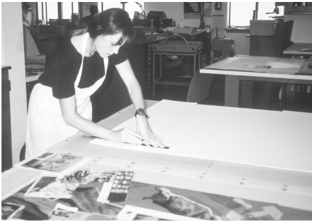
Fig. 12. Cutting jig-sawed edges