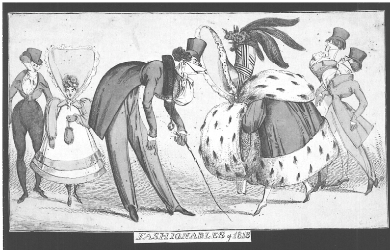
Fig. 4. George Cruikshank, Fashionables of 1818 , 1818, hand-colored etching, 21 x 34.5 cm. Princeton University Library (visual 103). Cruikshank employs a standard technique of caricaturists with his use of exaggerated line.