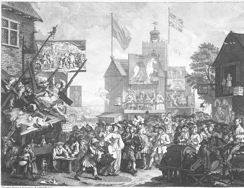
Fig. 2. William Hogarth, Southwark Fair , 1733, engraving, 44.5 x 51.5 cm. Princeton University Library (record id: 12983).