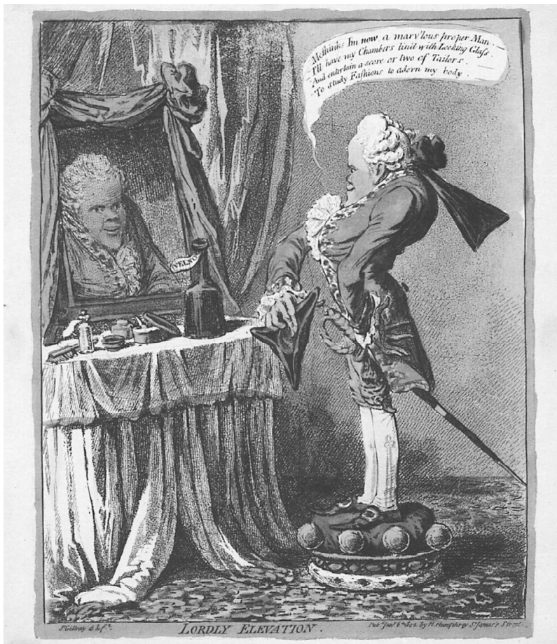
Fig. 3. James Gillray, Lordly Elevation , 1802, hand-colored etching, 24 x 29.7 cm. Princeton University Library (visual 3285). Here Gillray makes light of one's indulgence in self-flattery.