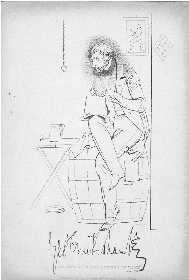
Fig. 1. A. Croquis, George Cruikshank , 1882, printed sketch, 22.6 x 14.6 cm. Princeton University Library (visual 548).