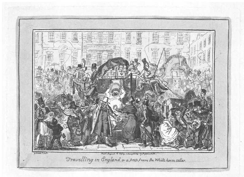
Fig. 5. George Cruikshank, Travelling in England or A Peep from the White-horse Cellar , 1819, hand-colored etching, 22.2 x 18.6cm. Princeton University Library (visual 323). In this print Cruikshank’s satirical wit and imagery focuses upon the difficulties that a person encounters in dealing with the daily routine of moving about among the urban masses.

In a cursory examination of Cruikshank’s prints in the collection at Princeton one finds that wove paper appears to be the predominant support, such as one example found with a Smith & Nutt 1816 watermark. Wove paper came into popular use for printing from copper plates in the late 1700s, when around 1768