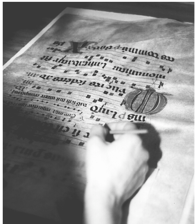
Fig. 2. Using prepared isinglass to consolidate flaking media on parchment.

In China various kinds of animal glues were implemented as binders in paint media during the T'ang dynasty