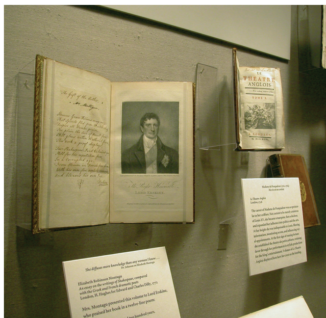
Fig. 1. Display supports made from Vivak co-polyester sheets

Vivak and Vivak UV are co-polyester sheets that have been patented by the company Makroform Ltd. Uses range from construction and visual communications (displays, vending machines) to medical purposes. Vivak Clear