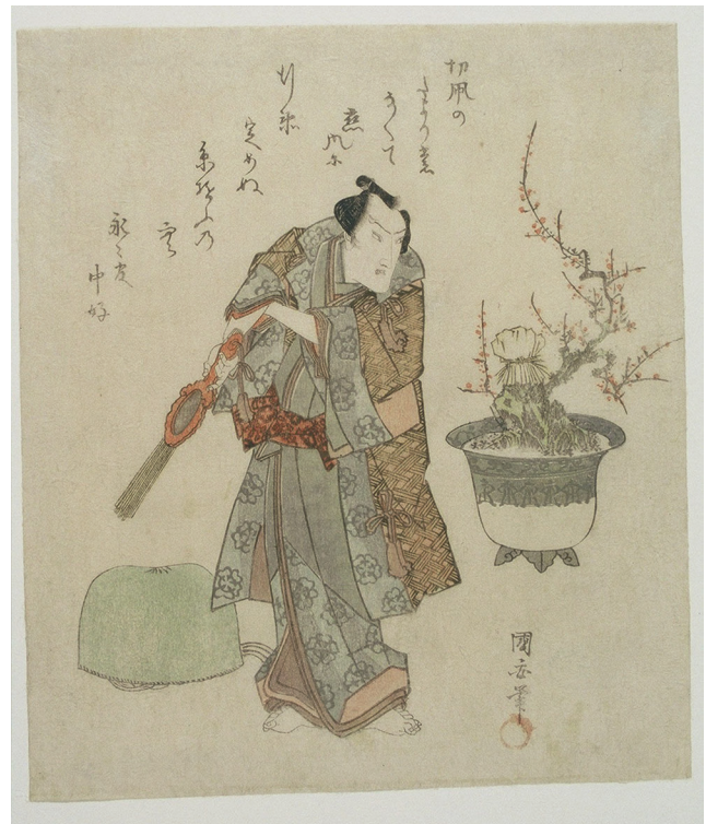
Fig. 10. Kuniyasu (ca. 1810–20), Man and Bonsai (8.2000.804.92), under infrared light.

a translucent, sometimes watery-looking blue. In ultraviolet it is a warm, light to medium gray. Examined with the infrared video camera it appears as a light gray tone or almost the same as paper tone (figs. 9–10). Although not evident in this undamaged print, dayflower sometimes has a drippy, mottled appearance where humidity or contact with moisture has caused the color to move or dissipate. This form of damage generally is not seen in indigo or Prussian blue.