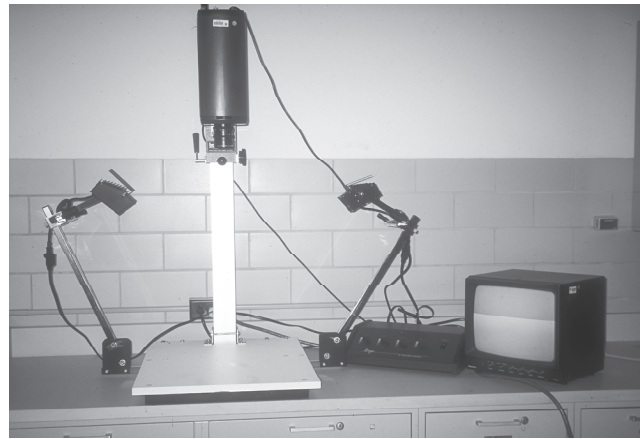
Fig. 1. Doya infrared video analyzer

Dye swatches from a Japanese dye recipe book (Yoshioka 1982) were examined in the three methods as a