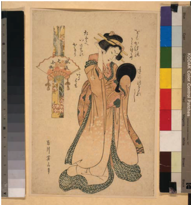
Fig. 6. Eizan (1800–1867), Modern Seven Komachi (2.01.201.56)

For centuries dayflower blue has been used in Japan to make an under-drawing on silk as a guide for painting or for applying stop-out for resist dyeing. It is a colorant that will completely wash out in water, and because of its solubility in water, dayflower is not generally used as a textile dye. Woodblock printers were surely aware of this sensitivity to moisture, particularly as they printed on dampened paper. Also, dayflower does not make an intense blue but rather a translucent cool or grayish-blue.