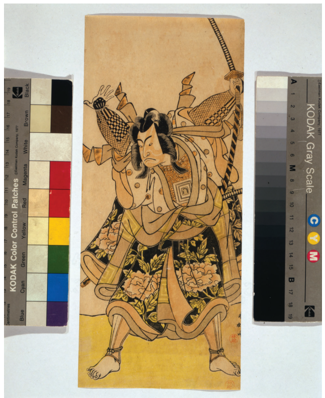
Fig. 8. Shunko (1760), Danjuro in Thunder God Pose (2.01.201.12)