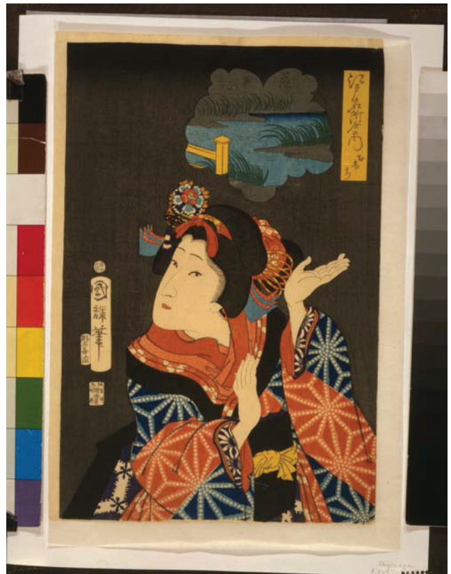
Fig. 5. Kuniteru (1867), Famous Places in Edo: Ai no Uchi (2.01.021.92)

These examples illustrate the potential for this method to help scholars interpret the original appearance of Ukiyo-e print colors, and to assist a collection custodian in identifying sensitive colors in order to better assess the risk to the print of further exposure to light.