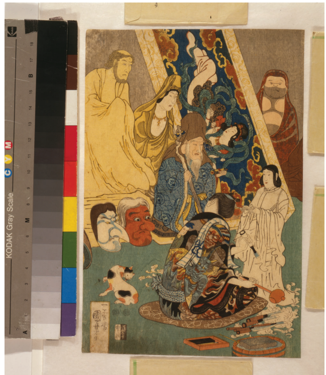
Fig. 4. Kuniyoshi (1850), middle panel, Sculptor and Gods (2.01.201.71B)

orange made of red mixed with yellow, have the characteristics of safflower when examined with these methods (fig. 5).