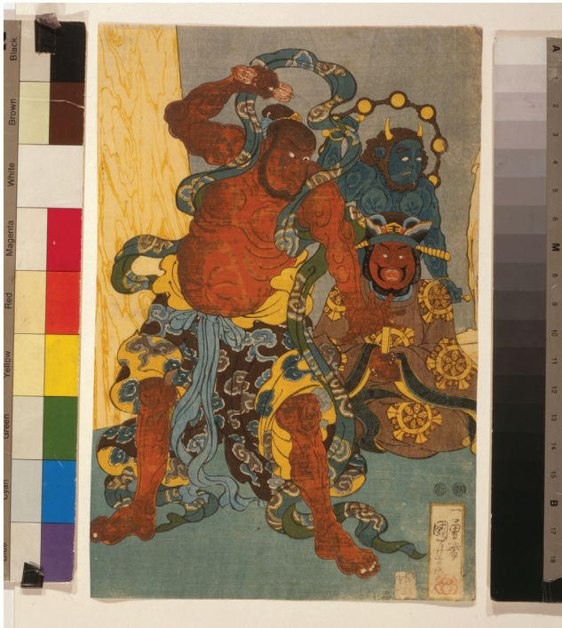
Fig. 3. Kuniyoshi (1850), left panel, The Famous Unrivaled Hidari Jinoro (2.01.201.71A)