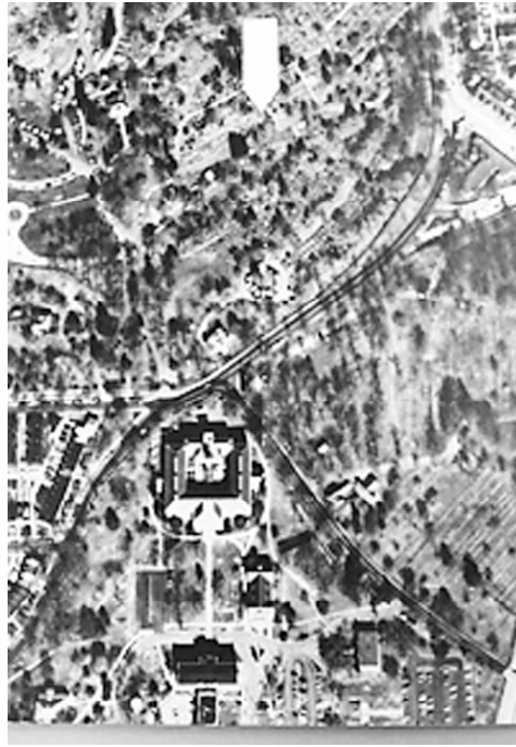
Fig. 4. Properly aligned mend just visible below the arrow

hardly visible. Again, no inpainting was done. Using this technique, the mended prints did not suffer from any local distortions as the two sides of the tear were reunited. The tears mended in this fashion were quite strong and did not fail when the photographs were flexed or held flat.