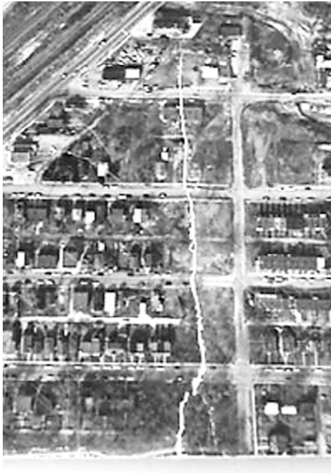
Fig. 3. Improperly aligned mend