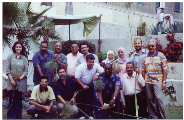
Fig. 2. The papyrus course participants and me (front row, third from right), posing for the camera. Some are holding papyrus stalks.

The Royal Library of the Ptolomies, which is often referred to as the Great Library of Alexandria, was founded around 300 B.C. during the rule of Egypt's King Ptolemy I, who sat on the throne from 305-282 B.C. Ptolemy was one of Alexander the Great's most important generals during his conquest of the known world at that time. It is Ptolemy who began the Greek rule of Egypt, which ended the Pharonic Period of native Egyptian rule of the empire that had lasted for thousands of years. Ptolemy wanted to establish a sort of "Library of Congress" in the ancient world where all the known knowledge of the universe written in Latin, Hebrew, Persian, Buddhist, and Egyptian would be gathered and translated into Greek. It would be one great depository for scholars from everywhere to visit and use the material. However, the Royal Library was destroyed during Roman