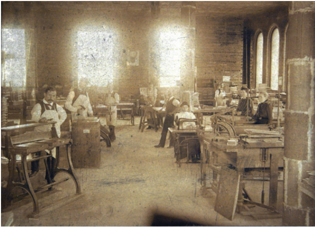
Fig. 1. The Newberry Library bindery in 1909. Note the sewing ladies on the right and the binders on the left.

Because of the similarity of binding style, along with very few existing records, we relied on ownership marks and call number labels to help date or glean information about binding practices before the 1960s. Numerous dies were created and hand tools were occasionally used with ink as well as gold leaf or foil (fig. 3). Ink was close at hand because along with the in-house bindery, the Newberry found it more cost effective to print various forms, flags, lists and cards used in the library. In 1914 a Multigraph printing machine was installed in the bindery, as well as punch-cutting machines for catalog cards. This practice seemed to wane by the 1950s, but it is important to note how closely related printing was to bindery operations.