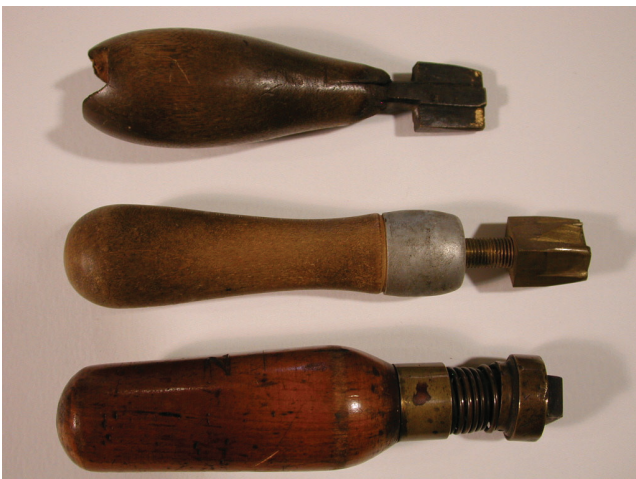
Fig. 3. Three different hand tools, all with various Newberry logo designs.

Ernst Detterer, custodian of the Wing Collection from 1931 to 1947, designed a single-spaced bindery type that endures today. The Newberry-Detterer type defines the look of the Newberry stacks and reference shelves. Every