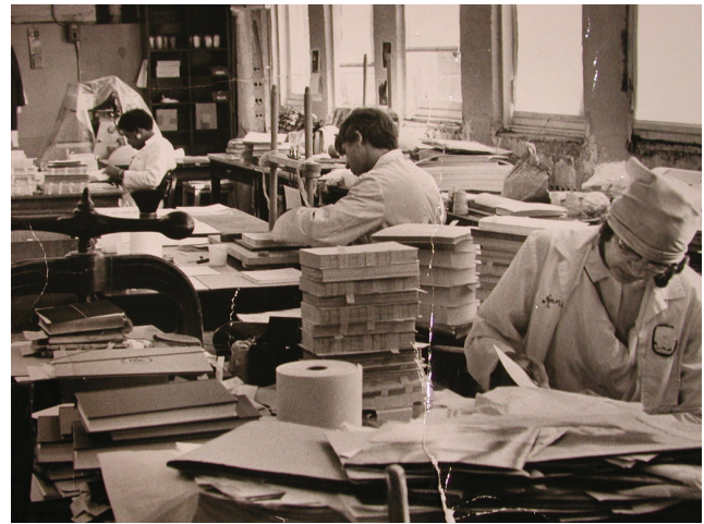
Fig. 8. The bindery during the 1970s.

Today's department of conservation services provides physical care for all of the library's collections. Routine duties include environmental monitoring, creating protec-