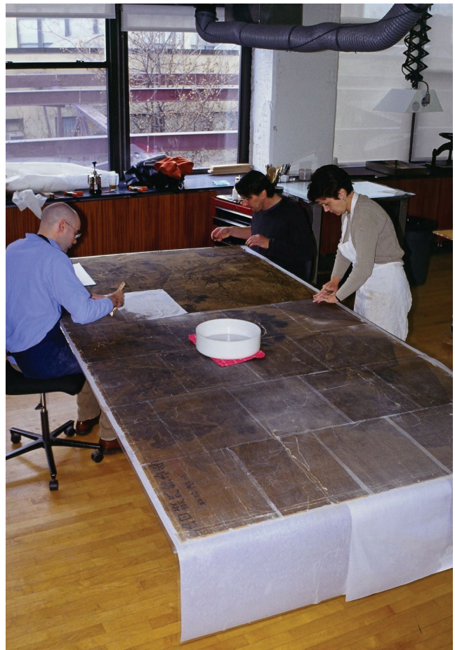
Fig. 1. Seventeenth-century Chinese painting from Taliesin being prepared with a facing of rayon paper

What made this treatment a hybrid? It is a Chinese painting, on continuous display, in an icon of American architecture. The panel structure is derived from Western painting conservation while the treatment and surface preparation used Japanese materials and procedures. Because the large stain at the bottom was in the paper below the silk as much as the silk itself, local bleaching and