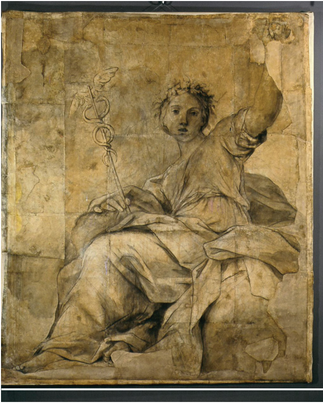
Fig. 7. Seventeenth-century Italian preparatory cartoon in charcoal on multiple sheets of overlapping paper before treatment

sure to practices that have filtered into our treatment vocabulary. This exchange has enhanced the North American and European traditions of inquiry, analysis, and practice that are the foundation of our training as paper conservators, and the Book and Paper Group has done much to promote these advances.