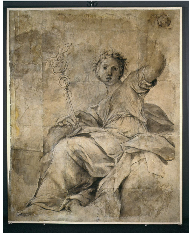
Fig. 8. Seventeenth-century Italian preparatory cartoon after treatment and mounting on a Japanese screen style panel