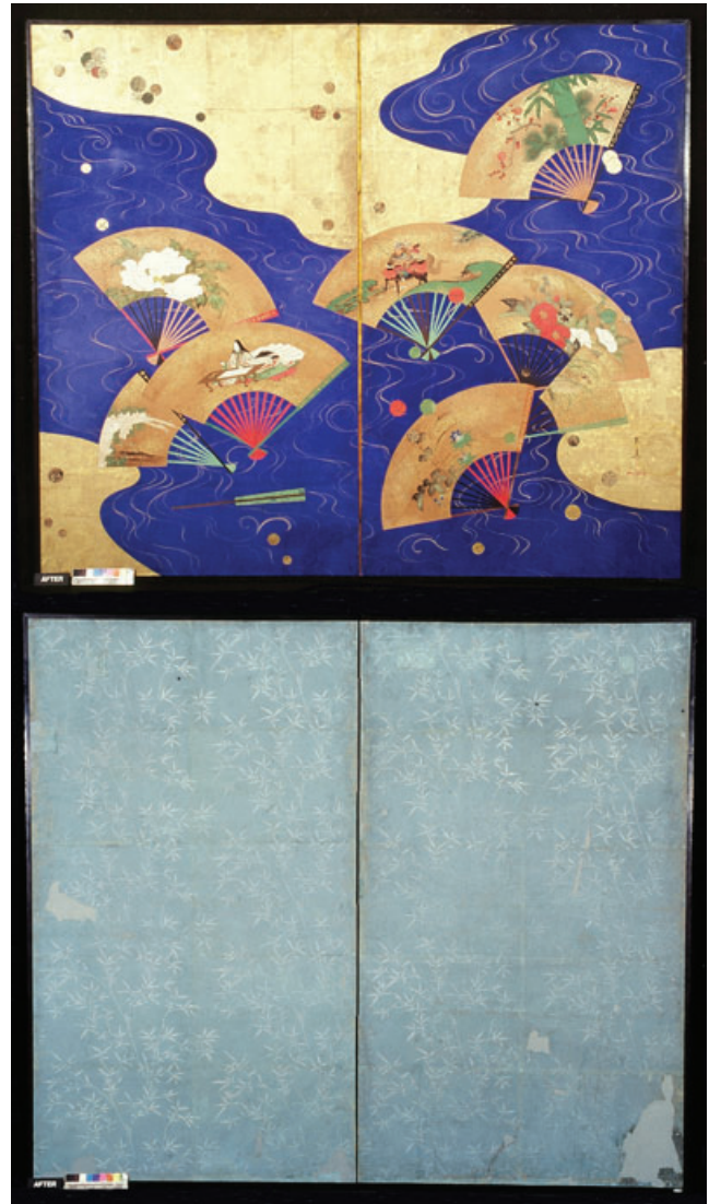
Fig. 6. Japanese screen after overall treatment of painting and back papers

Procedures used on scrolls for reinforcing tears with cut strips after lining, for minimizing the overlapping edges of a fill on thin paper, for burnishing the linings, and for assembling sections and flattening under tension have been enormously useful as well, particularly on very lightweight or translucent Western works such as drawings on tracing paper.