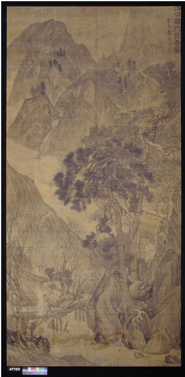
Fig. 2. Seventeenth-century Chinese painting after treatment and mounting on an aluminum honeycomb panel

rinsing were possible after the first lining was applied, although with only limited success. Similar stain reduction techniques have been used on Western works on fabric as well as Asian works on paper. Because bleaching agents are not widely used in either Japan or China, I welcomed comments from several textile conservators and scientists, specifically about the safety of exposing protein fibers to bleaching agents. Because I sensed that it was viewed with no more wariness than bleaching cellulose fibers, I felt that it was a legitimate difference with traditional practice. The inpainting was confined to tear edges and abrasions on the