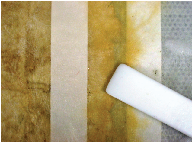
Fig. 3. Using a Teflon folder to encourage adhesion between pulp and paper.