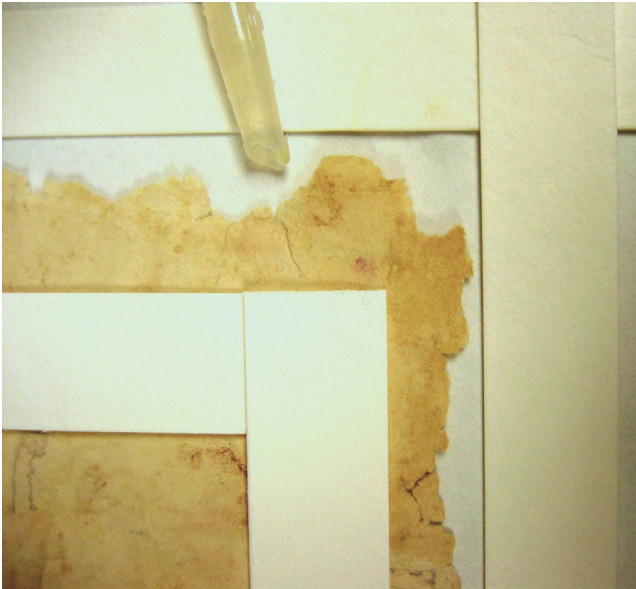
Fig. 2. Using a dropper to apply pulp.