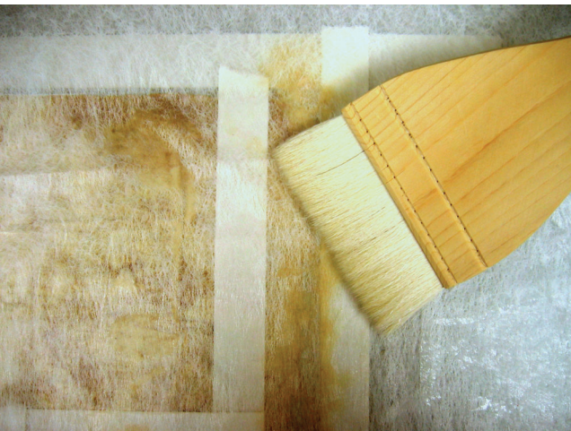
Fig. 4. Applying dilute methyl cellulose with a hake brush.

Minimal equipment was required to carry out this project, no more than a blender for mixing pulp and the suction table for the pulp filling process. A few basic supplies were required: pulp, thin blotter for use on the suction table, thicker blotter for masking the fill area, a water sprayer, a dropper and/or small beakers for pulp application, a Teflon folder or roller for smoothing the pulp after filling, spun polyester sheets, and a Japanese hake (sizing) brush.