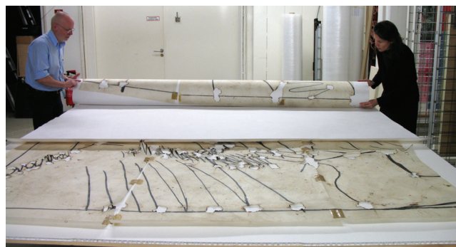
Fig. 6. Unrolling the drawing for the first time. Conservators Udo Schade and Irene Brückle pictured.