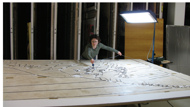
Fig. 7. Applying BEVA and Japanese paper repairs with heated spatula.