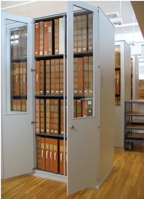
Fig. 1. Mounted drawings are housed in Solander boxes, stored upright in locking cabinets

large shared tables in the center. In the laboratory for wet treatment, sinks line the back wall, there is a large suction table, humidity chamber, fume hood, and elephant trunk extraction system. For a recent grant-funded project, the lab had a photographic copy stand custom-made by Manfred Meyer, a conservator and engineer who furnished the lab at the Albertina Museum in Vienna (fig. 3). The artwork to be photographed lies on a velvet-covered slant board with a ledge at the bottom. A digital camera is mounted on an angle so one can comfortably see the view screen and the camera cannot fall on the artwork. It is held in a fixed position, parallel to the slant board, and moves up and down the angled bar. The light fixtures are mount-