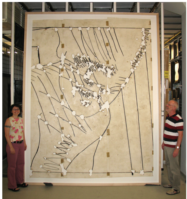
Fig. 9. Frank Dornseif's Self Portrait in Nepal , 1987, after treatment and mounting. Black marker, yellow oil stick, studio dirt, and packing tape on tracing paper with burnt holes, 3.23 x 2.48 m. Collection Kupferstichkabinett-Berlin (LB 68-1992).