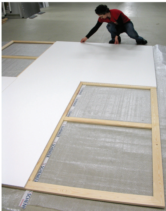
Fig. 5. Constructing mount of paper honeycomb panels glued to a wooden lattice.

The creases were lightly wetted with deionized water applied with a fine brush and then quickly weighted between smooth mat boards. The tears were repaired with sekishu shi Japanese paper (31 gm 2 ) and BEVA film applied with a heated spatula through silicon-coated polyester film (fig. 7). To readhere the lifting tape, BEVA film was inserted between the tape carrier and the paper surface.