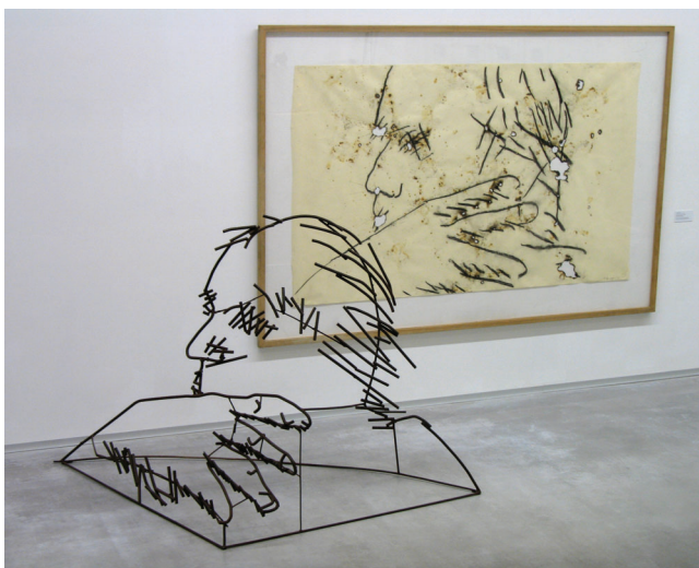
Fig. 4. Installation view of Self Portrait , 1992, unpainted rebar and black marker on cream wove paper with burnt holes. Collection Berlinische Galerie.

ally mounts the pieces by stapling them to a white, rigid support and then frames them with Plexiglas.