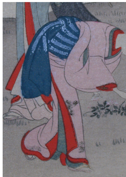
Fig. 4. Detail of printed reproduction.

style painting. The edges of the losses were trimmed and filled with thick, darkly toned silk inserts. Perhaps to compensate for extensive media abrasion and loss, areas of the painting had been overpainted with white paint in some areas which stood out against the overall aged background.