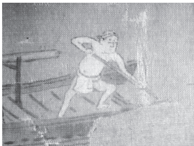
Fig. 5. IR image of the fisherman located near figure 1.

Infrared Reflectography (IR) confirmed that Harunobu worked meticulously in both his prints and paintings. An example of the original line design is seen in a detail of the