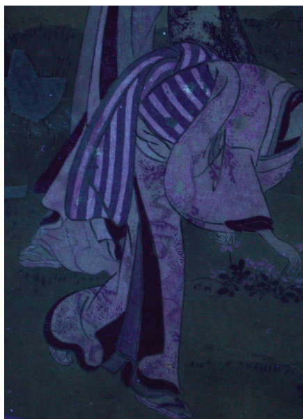
Fig. 2. Detail of kimono in ultraviolet light.