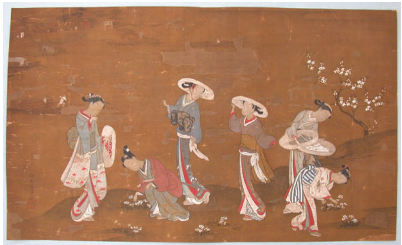
Fig. 1. Suzuki Harunobu, Spring Outing on the Banks of the Sumida River (Museum of Fine Arts, Boston). For pigment analysis figures 1–6 are numbered from left to right.

The painting was in brittle condition with a discolored silk support and many disfiguring infills. It had sustained extensive loss in both the support and the media. In a past treatment, the painting had been removed from its hanging scroll format and mounted on a framed panel with a gold-leaf border, so that it could be hung like a Western-