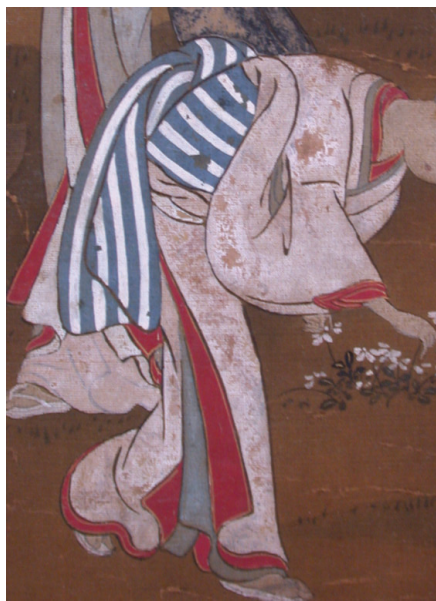
Fig. 3. Detail of kimono in visible light.