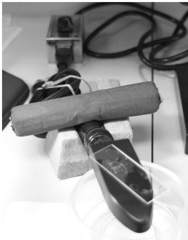
Fig. 1. The ninhydrin test setup using a tacking iron connected to a rheostat for heating the sample

The extreme sensitivity of the ninhydrin test can make it difficult to work with. A single fingerprint on a reference paper known to be gelatin-free can show a very slight purple color in this test (Barrett and Mosier 1992). The more contact a sheet has had with skin, the more distinct the positive result will be. For this reason, it is necessary to define the intensity of color constituting a positive test. Also, special care is required to handle the samples, slides,