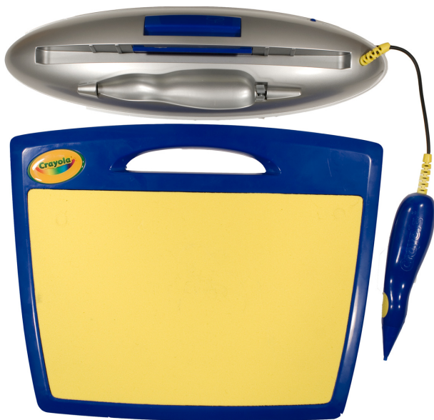
Fig. 1. The Crayola Cutter

The Crayola Cutter can be used to create a variety of fills for losses ranging from simple to complex in works on paper. In this case, the precision of the Crayola Cutter allowed a fill to be cut quickly and easily for a small, complex loss. See figures 6–11.