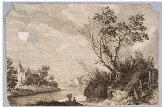
Fig. 10. The fill adhered to the print with wheat starch paste