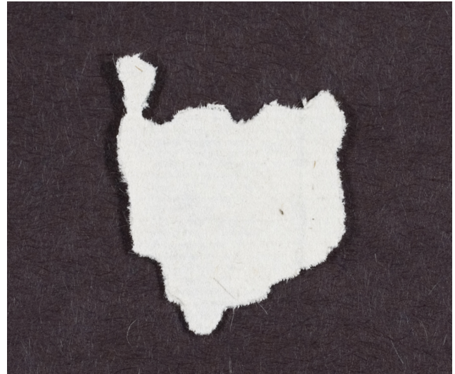
Fig. 9. The fill after it has been pulled away from the rest of its sheet