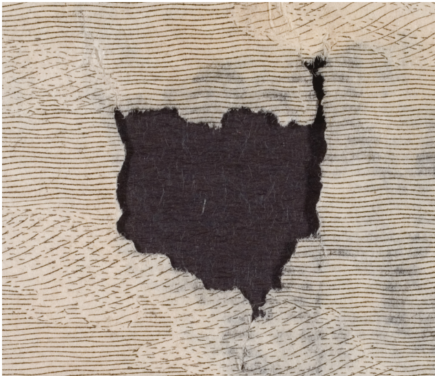
Fig. 7. A detail of the loss, recto. A template, made by tracing the loss onto polyester film, was used to make an outline of the fill to be cut from a thin western laid paper