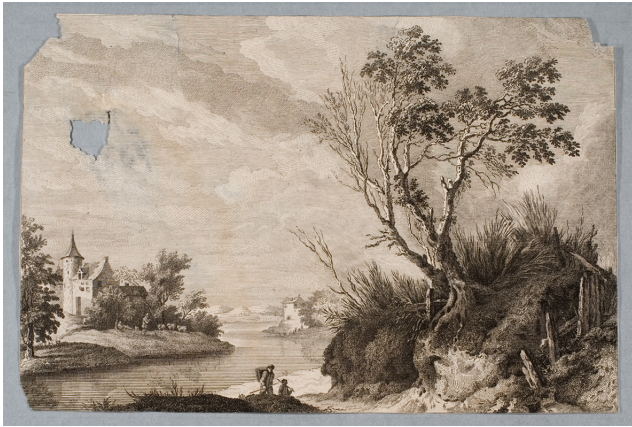
Fig. 6. An etching with an irregularly shaped loss in the upper right quadrant