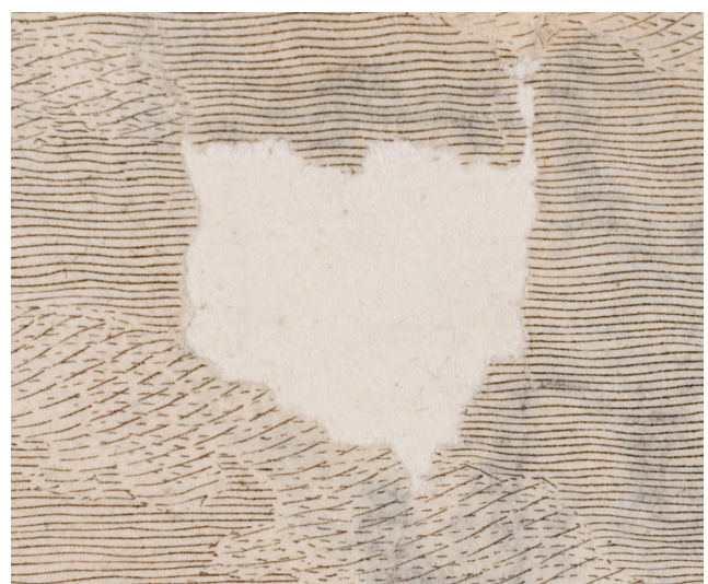
Fig. 11. A detail of the fill, recto. The edges of the fill were pared down and feathered further using water and a needle