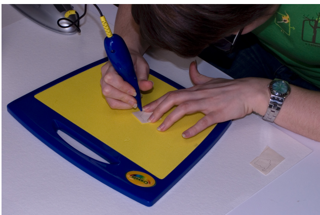
Fig. 8. Following the pencil line with the Crayola Cutter to create a perforated outline