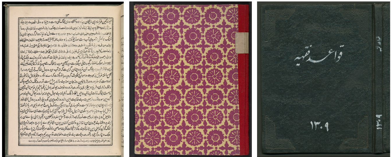
LEFT TO RIGHT

The bindings on the Kabul Binder volumes included in the project were not original to the text blocks. They exhibited signs of earlier sewing, evidenced by at least one, and sometimes multiple, sets of empty stab sewing holes. Some volumes included electrostatic copies, often of the title page, but occasionally of entire sections. These copies appeared to be replacements for damaged or missing leaves, most likely created and inserted to complete the lithographed texts. Kabul Binder text blocks were newly stab-sewn through three holes with a double pass of thick stiff thread, knotted in back at the center hole. These text blocks were aggressively trimmed, stuck on endbands were adhered, and single bifolio endpaper sections of poor quality machine-made paper were tipped on to the first and last pages. Text blocks were cased into the bindings using just the newly added endpapers. The case bindings were covered with a blue-black plasticized textured bookcloth. Most volumes were blind stamped on the boards and some had bibliographic information written in white paint.