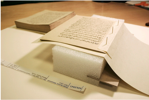
Fig. 5. Ethafoam sewing jig constructed to ease resewing of stab-sewn text blocks

structures would hinder physical access, the digital library images provided are adequate surrogates.