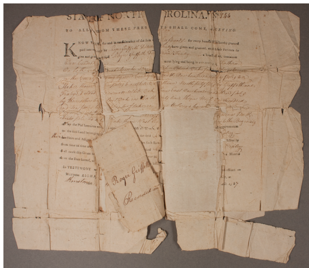
Fig. 1. Before Treatment: 18th century indenture

Other than basic page repair, there are several typical problems that we encounter time and again in these collections, and over time we have adopted practices that streamline preparation. Extremely brittle items and those with extensive losses due to mold, insect, or iron gall ink damage are housed in Mylar and scanned in the sleeve.