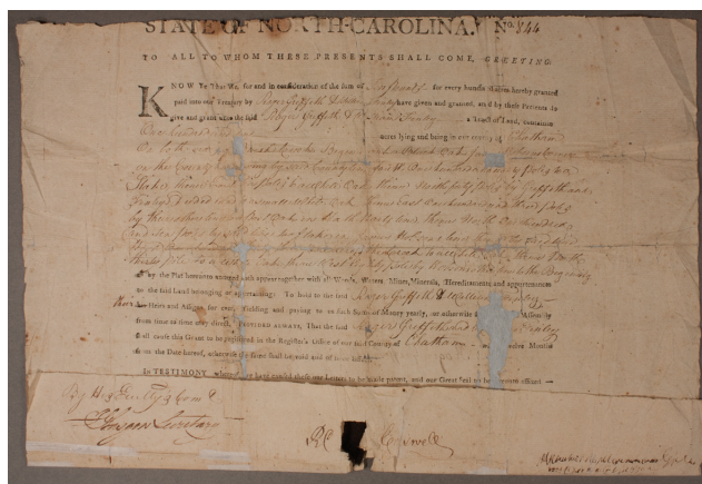
Fig. 2. After Treatment: Indenture stabilized for digitization