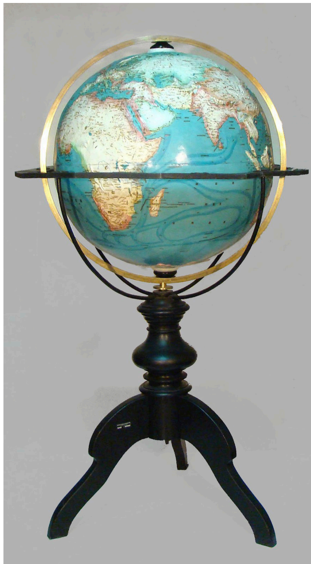
Fig. 12. The globe after treatment

Some cleaning was carried out on these metallic elements, focusing on the elimination of corrosion on the bronze elements. This cleaning was not very deep, given the instability of the painted metal. After the metal had been brought into