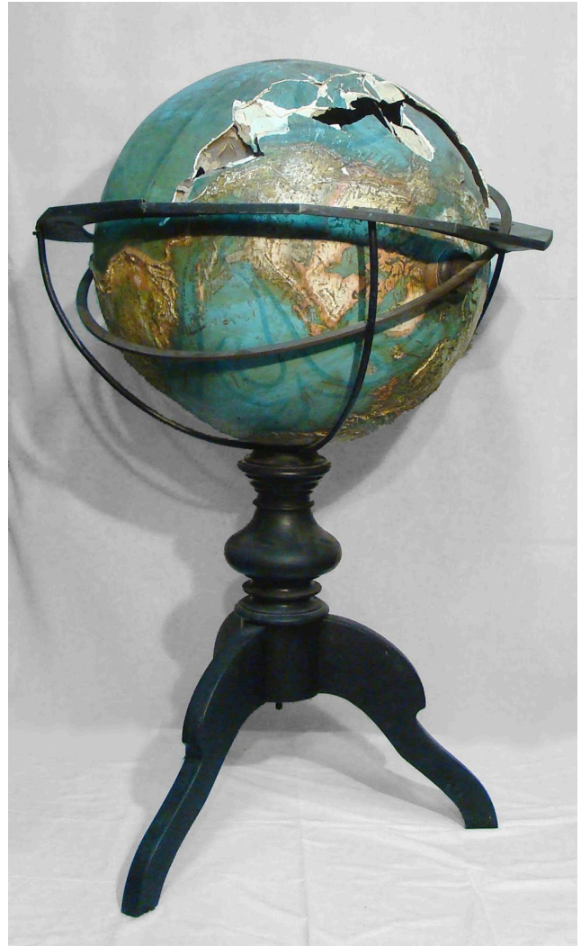
Fig. 1. The globe before treatment

The globe and stand had also been subjected to use and wear over the past 160 years. Prior to treatment, the globe had a layer of yellowed, brittle varnish that compromised the general view of the object. There was also an accumulation of surface dirt that made the labels difficult to read. Abrasion and the use of inappropriate cleaning products had caused additional loss of the varnish layer, weakening of the paint layer, and loss of certain labels and the information they contained. Overpaint was also noted in some areas, especially in the Argentinean region (fig. 4).