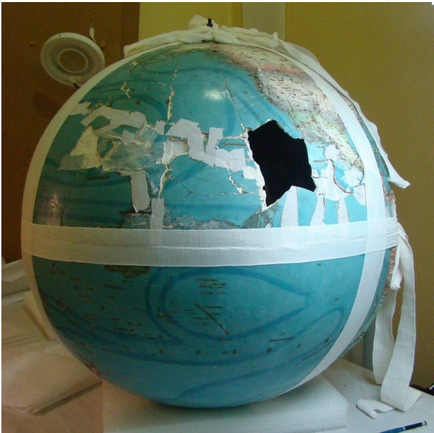
Fig. 9. Re-attachment of the two halves of the sphere

conservation-quality materials. For the broken pieces and consolidation of the original plaster, a neutral-pH ethylene-vinyl-acetate (EVA) adhesive was used (fig. 7), which was chosen for its strength and reversibility with water.