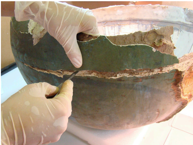
Fig. 5. Sphere separated into two halves