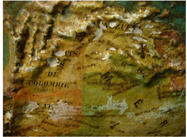
Fig. 4. Detail showing aged varnish layer