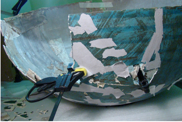
Fig. 7. Consolidation of broken pieces