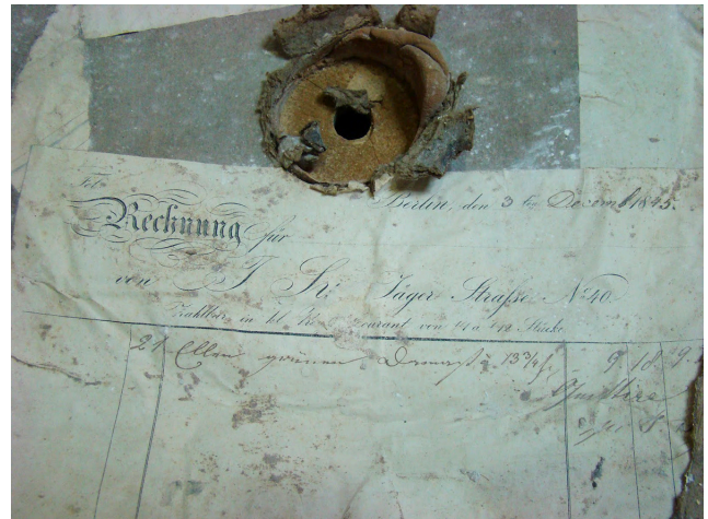
Fig. 6. Paper used as part of the papier-mâché structure printed with the date 1845