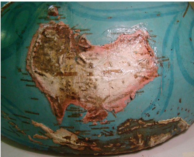
Fig. 8. During the cleaning process