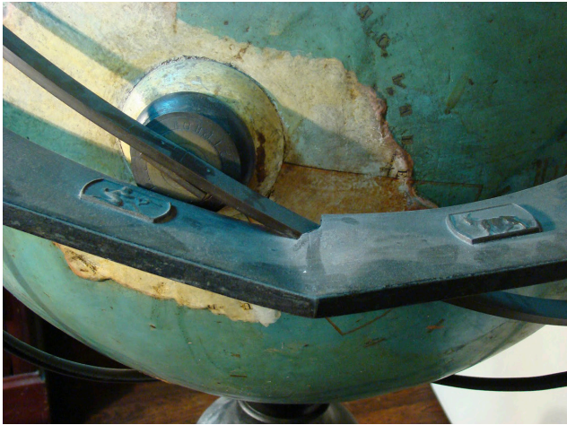
Fig. 3. Detail showing the damage suffered by the metal horizon ring