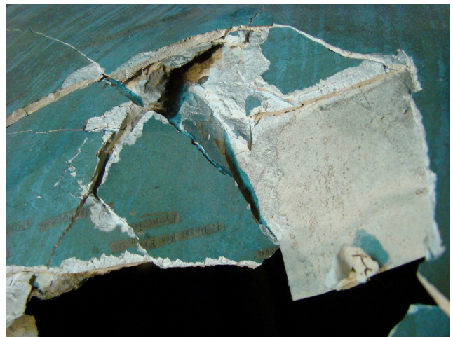
Fig. 2. Detail showing breakage and structural loss