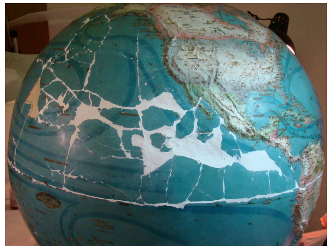
Fig. 10. Detail, filling losses

A final layer of ketone resin dissolved in white spirit was used to varnish and protect the retouched areas of the globe. Regrettably, two years after the treatment, there has been a slight darkening of these areas. This is attributed to the quality of the varnish and the ketone resin, which is softer than