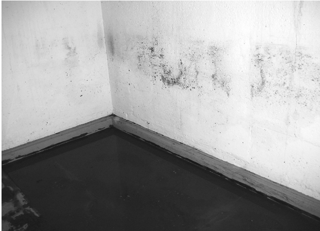
Fig. 1. Staining on stairwell walls indicating the highest level reached by floodwaters.

by the floodwater. On the Ground Floor, there was staining from floodwaters on cubicle walls, and in the stairwell, more staining on walls indicated the highest level that the water had reached (fig. 1). In the stairwell leading to the Lower Level, several feet of standing floodwater, polluted with sewage and various medical contaminants, completely blocked access to a storage room where map cases and filing cabinets housed prints, photographs, paintings, records, and archival documents.