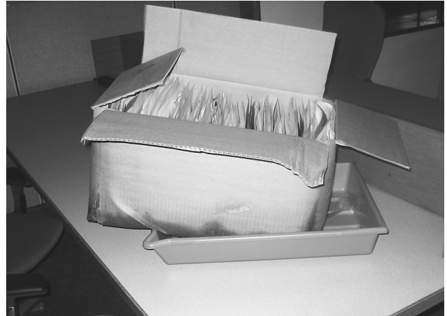
Fig. 2. One of two cartons containing rare medical pamphlets that were submerged in the floodwater.

The majority of affected collections at Ehrman were from the general collection; nearly all of the special and rare