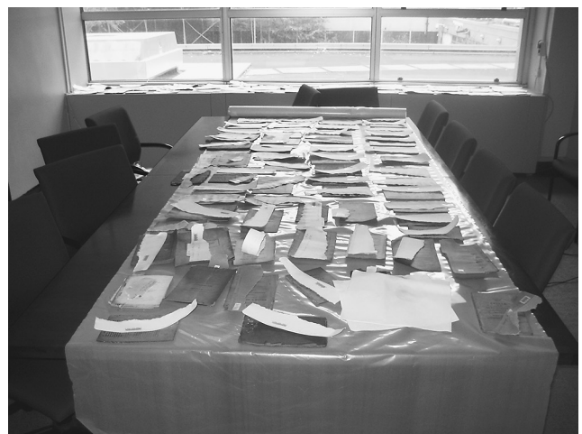
Fig. 4. Pamphlets laid out to dry in a Medical Center conference room.