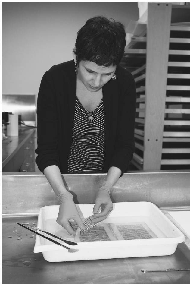
Fig. 5. The author working on thawed pamphlets in a water bath.

In the early days of the project, most pamphlets treated received extensive surface cleaning, mending, guarding, and rebinding into original covers or new paper covers, but progress was considerably slower than had been initially