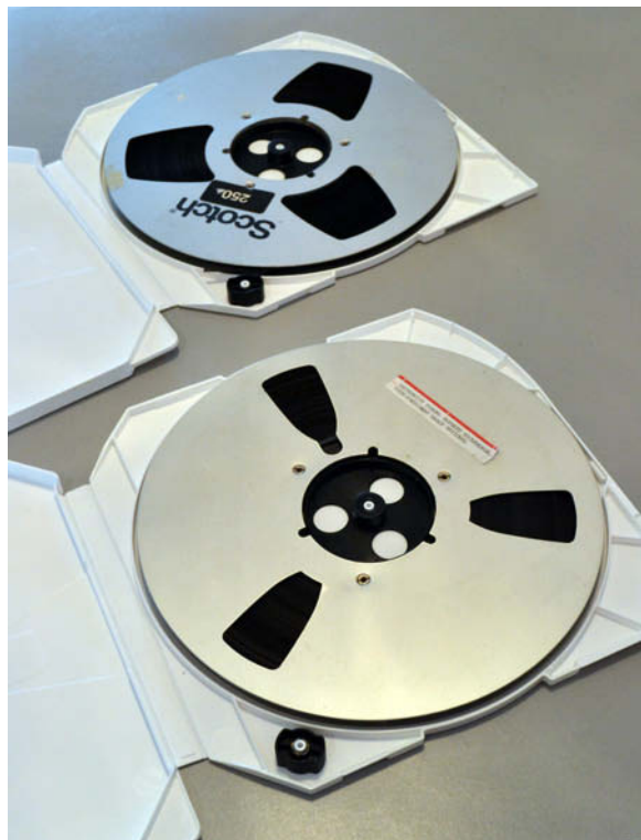
Fig. 3. Cleaned reels and tapes, respooled with new heads and tails in Stil hard case archival boxes made to stand vertically on a shelf or in a box. Note that the box comes with securing hub and secondary hub for larger core reels.