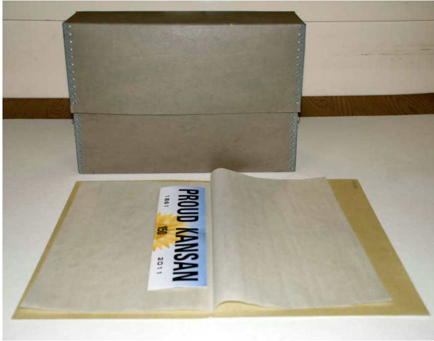
Fig. 6. Bumper sticker within folded piece of silicone release paper, placed within a standard alkaline folder.

shows for public broadcast, decided that he wanted his collection of tapes, including finished programs, production elements, and various bits of video ephemera, to survive into posterity. Since that time, Media Burn has been digitizing and cataloging video. Currently there are over 7,000 tapes online, all of which are available for free (Media Burn Archive 2018). Weinberg has deep connections with the greater video production community and as a result, Media Burn has added the work of many artists, documentarians, and other video makers to their collections.