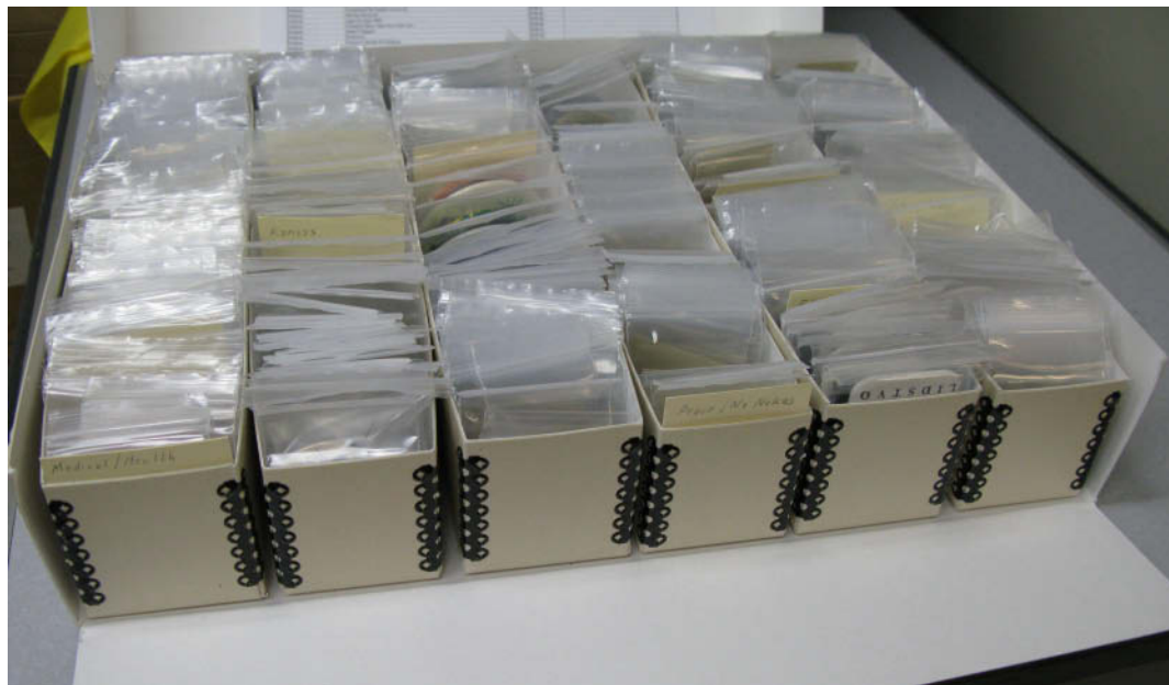
Fig. 5. Buttons housed in polyethylene bags, placed within slide trays in a slide storage box.

Media Burn is a small independent video archive in Chicago. It began operations in 2003 when founder Tom Weinberg, who had produced several documentaries and television