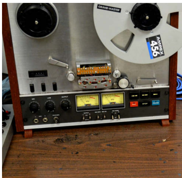
Fig. 4. 10-in. reel-to-reel player/recorder with head protectant shield removed for flaking magnetic layer to exit the machine. Note the flaked materials on the table.

archives had brought the tapes directly from the damaged area, and they were not yet accessioned, so staff had to make a list for them to provide a record of what was at the lab.