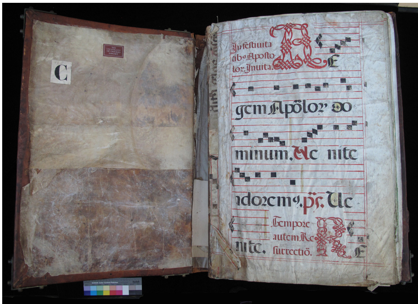
Fig. 2. Before treatment

spine. The old cords were removed from the channels and holes, and lifted off the board where adhered.