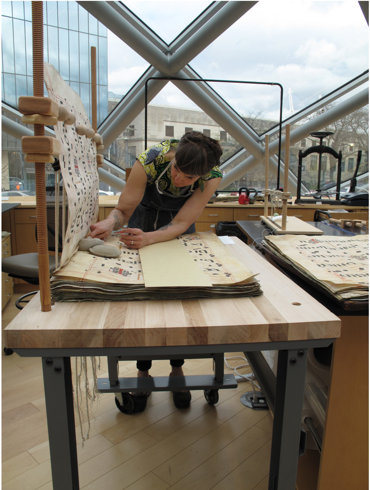
Fig. 4. Using the oversized sewing frame