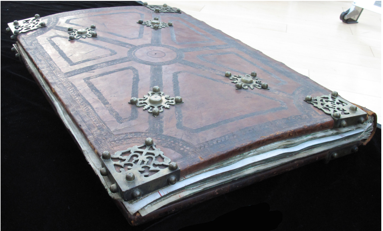
Fig. 1. Before treatment

exacerbating the poor condition of the book. The book was prioritized for conservation because the Special Collections Research Center curators did not want to limit its use or risk further damage from handling.